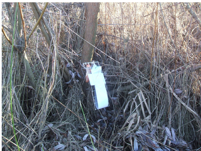
Fig. 2. Design of the hair-trap used in this study placed in a tree trunk. The adhesive tape was partially removed to allow observation of the structure; it usually covers the entire surface of the larger wire mesh piece.

Marten Martes martes ; Lynch et al. 2006) trying to ensure that if a Least Weasel is present, it will come some times around the trap (King 1975, Sheffield & King 1994, Erlinge 1995, Jedrzejewski et al. 1995, Brandt & Lambin 2007). The hairs collected in the traps were processed following the procedures of Teerink (1991) and identified using Faliu et al. (1980), Teerink (1991) and Toth (2002).