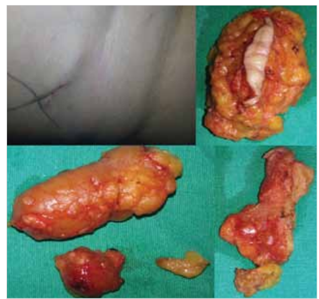
Figure 1. Old appendectomy scar and resected specimen, cicatricial mass and lymph nodes