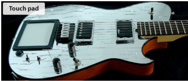
Figure 2. Guitar with built-in touch pad. © Hugh Manson, Photo by Jas Morris