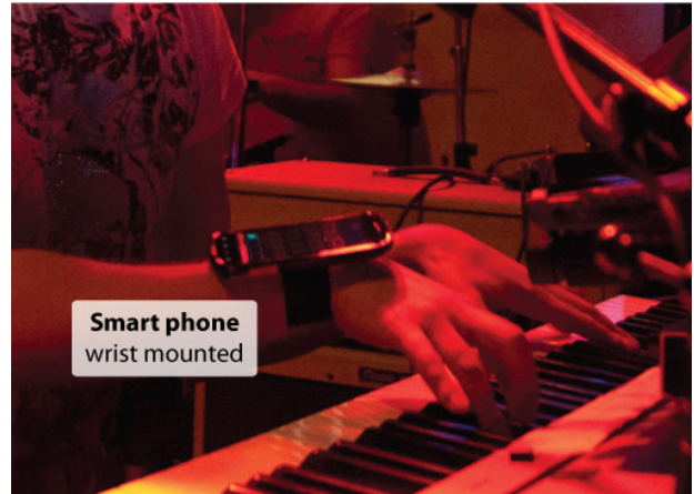
Figure 6. Playing the piano while having remote control of various effects on stage.

for controlling and generating sound at (1) the digital audio workstation (DAW), (2) the software synthesizer or (3) at the guitar effect floor board.