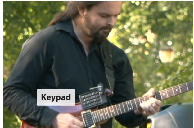
Figure 4. Guitar with attached key pad.

playing the multimodal guitar in a studio session, presenting all features separately, illustrates each augmentation in an understandable and audible manner.