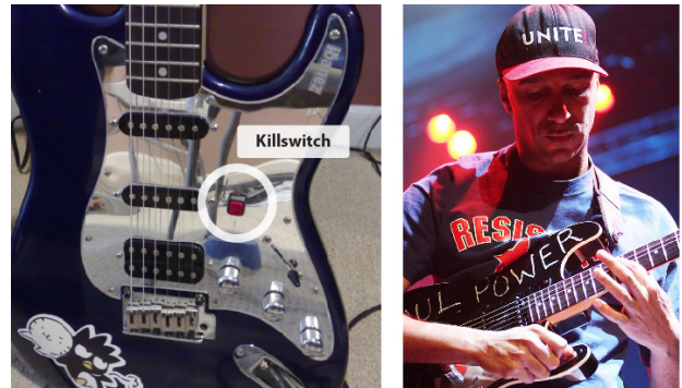
Figure 1. Guitar with a push button Killswitch (left,), Tom Morello playing the Killswitch live (right,)

Tom Morello (Figure 1, right), guitarist of the band “Rage Against The Machine”, is one popular artist who uses the Killswitch for his playing. In a live video from