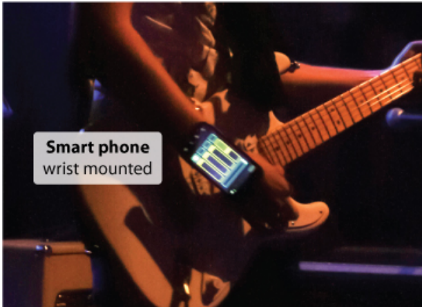
Figure 5. The display of the wrist mounted smart phone while playing the guitar.

examples, we combined different features such as remote effect control, gestural playing, high accessibility and low assembling costs in one framework.