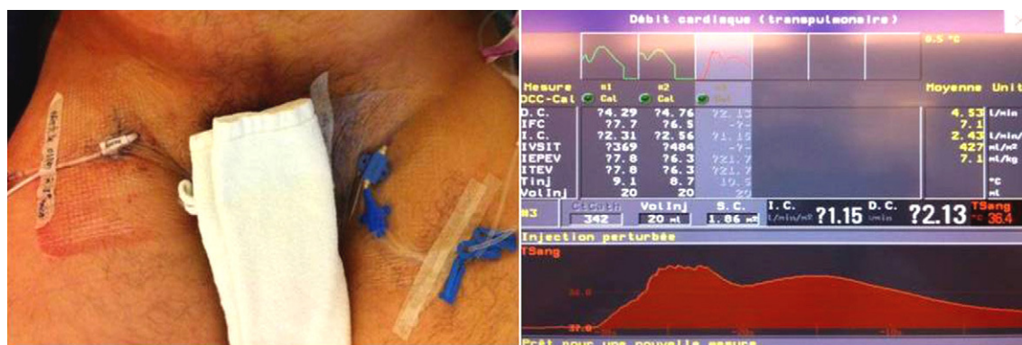
Figure 1 The transpulmonary thermodilution (TPTD) curve prior to draw back the right femoral PiCCO™ catheter. Please note that the TPTD curve is characterized by a premature as well as a late peak with a dilution appearing large and biphasic (CI value = 1.15 \text{ Lmin}^{-1} \text{ m}^{-2} ).

intensive care unit for ongoing care. Forty-eight hours later a partial cerebellectomy was carried out in order to control elevation of intracranial pressure.