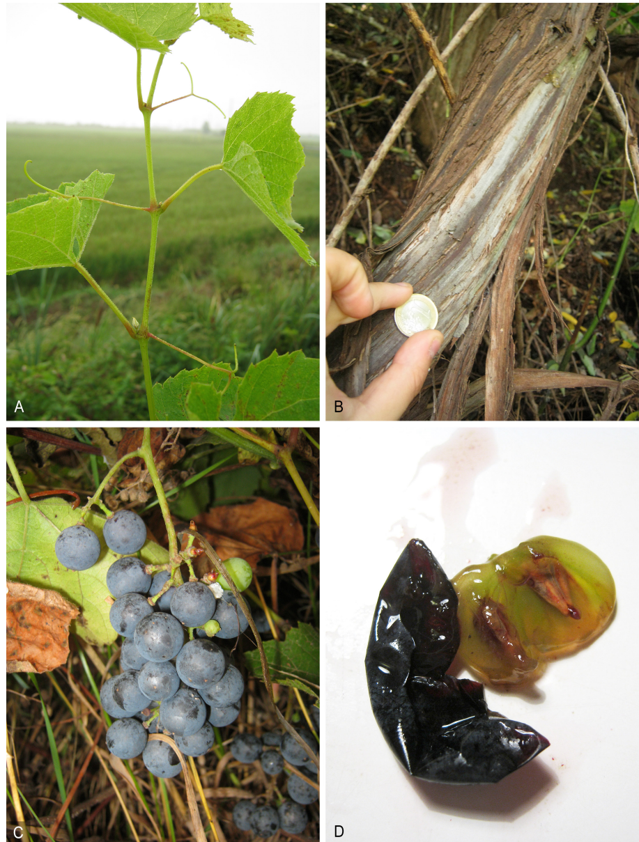
Fig. 4. Vitis xnovae-angliae additional morphological traits – A: continuous tendrils; B: stem and exfoliating bark; C: infructescence and pedicels with characteristic residuals of red mesocarp after detachment of berries; D: berry with mucilaginous mesocarp clearly separating from exocarp. – A, C, D: Albuzzano, Italy; B: Bereguardo (Moriano), Italy.

According to Moore (1991), the native range of Vitis xnovae-angliae comprises the states of New England (NE United States), where it was described by Fernald (1917). However, its occurrence in further sites where the ranges of V. labrusca and V. riparia overlap is possible, as