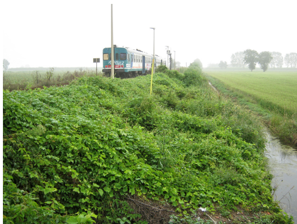
Fig. 5. Vitis xnovae-angliae naturalized population in Albuzzano, Italy, covering railway ballast.

with V. aestivalis and with both V. aestivalis and V. riparia were also mentioned, whose occurrence in the wild is quite doubtful, due to their difficult reproduction from cuttings and their susceptibility to phylloxera and downy mildew, deficiencies which soon caused their rejection from French viticulture, see Galet 1988). In Italy, V. xnovae-angliae is currently known from the N part of the Po Plain from Lombardia to Veneto, which corresponds, along with the NE part of Emilia-Romagna, to the traditional and most important cultivation area of ‘Clinton’ in the country (Rossi 1920; Istituto centrale di statistica del Regno d’Italia 1937; Istituto centrale di statistica & Ministero dell’agricoltura e delle foreste 1973, 1974). The presence of V. xnovae-angliae is expected in further European countries (e.g. Austria, Hungary, Romania, Switzerland, former Yugoslavia), where the cultivation of labrusca-riparia hybrids is reported (Galet 1988; Ufficio federale dell’agricoltura UFAG 2014+).