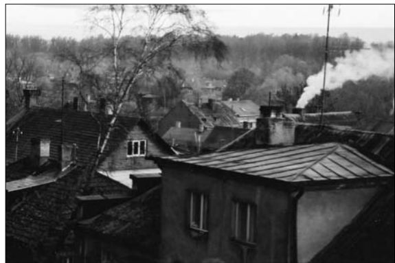
Figure 2: View of Supilinn