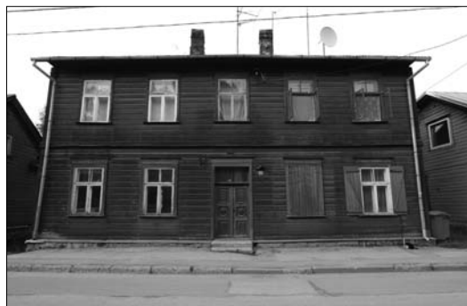
Figure 4: An apartment building at 33 Tähtvere Street. This building possess typical features of wooden houses in Supilinn, including two stories with small apartments (one room flat with integrated kitchen), simple symmetrical façade, gable roof, wooden cladding and traditional proportions on windows (with shutter) and doors.

There are usually high gable roofs, windows with vertical proportions, and occasional simple decorations. The buildings in Supilinn are modest, but the variety of one- and two-story buildings produces a more unique environment than Karlova, another wooden neighborhood in Tartu.