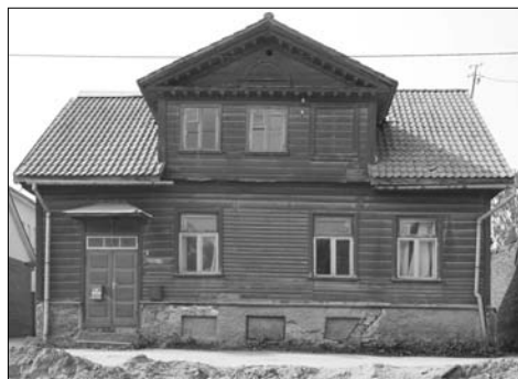
Figure 5: A small house at 34 Emajõe 3. This building possess typical features of wooden houses in Supilinn, including one story with rooms on loft, symmetrical façade, gable roof, wooden cladding and traditional proportions on windows.