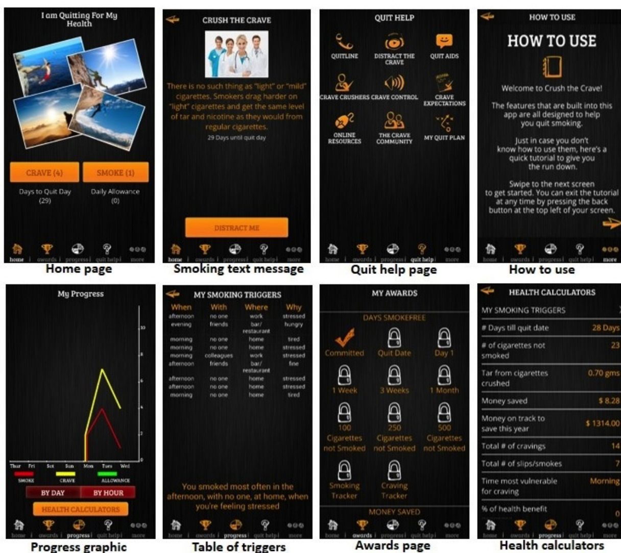
Figure 2. Screenshots of the quit-smoking mobile phone app, CrushtheCrave.

and tabular performance feedback (see Figure 2). The app also provides online distractions to help smokers deal with their cravings. There are social media tools, such as a YouTube channel and opportunities to chat with friends online to distract a user until the craving subsides a few minutes later. Evidence-based information is available for assisting participants during the quitting experience on topics such as relapse and dealing with cravings. Furthermore, data are collected in real time to both support the user and to track the usage of the app allowing for push notifications, helpful reminders, and ongoing data collection. Finally, Crush the Crave provides access to evidence-based cessation services such as smoking cessation quitlines and explains the benefits of, and dispels myths around, nicotine replacement therapy.