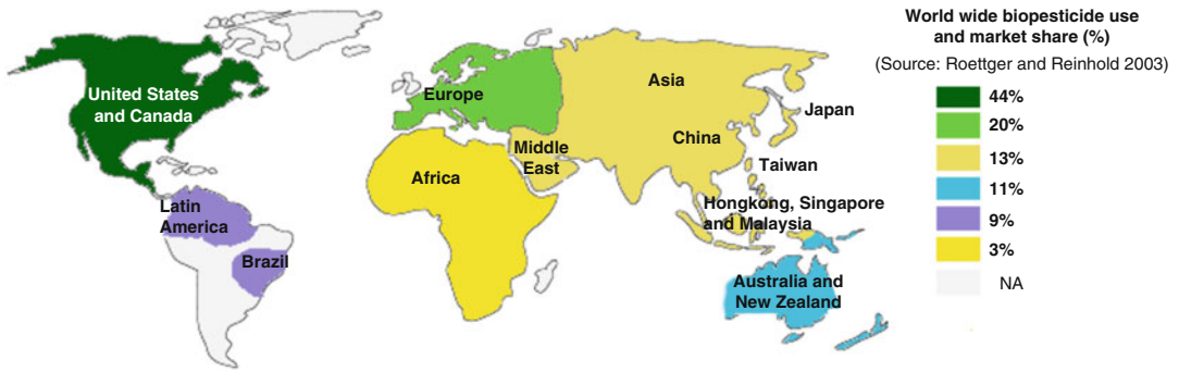
Fig. 2.2 Global biopesticide use and market

Keeping in mind the importance of minor crops (defined as any crop grown on 300,000 acres or less), the US Department of Agriculture (USDA) initiated the Interregional Research Project No. 4, commonly known as IR-4. The USDA IR-4 program has provided grant funding to key influencers such as land-grant university extension specialists to demonstrate with the end user the performance of biopesticides in realistic programs with conventional pesticides (Radcliffe et al. 2009). Overall progress of biopesticides in the USA can be considered as satisfactory. According to EPA data in the USA, 102 microbials, 52 biochemicals, and 48 semiochemicals are being used as biopesticides (USEPA 2011).