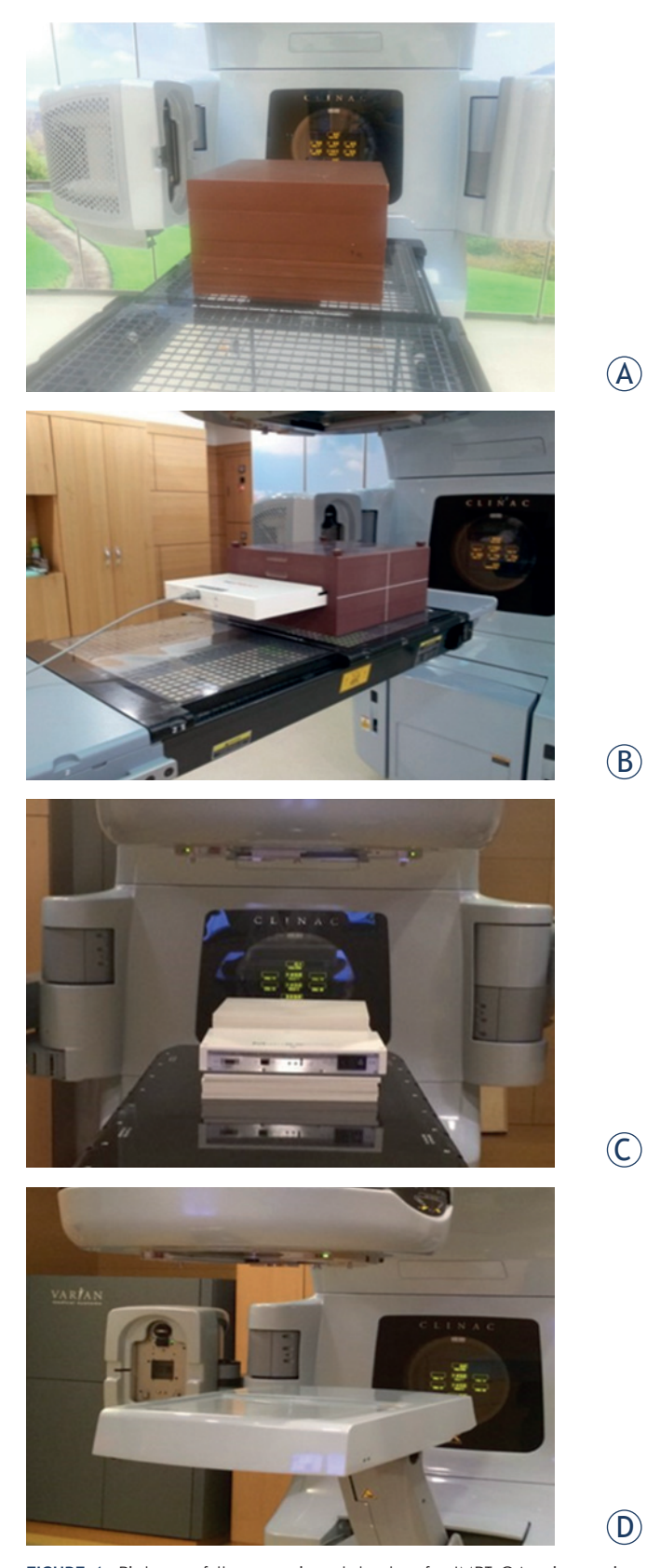
FIGURE 1. Pictures of the experimental setup for IMRT QA using various dosimetric tools. (A) Film, (B) Mapcheck, (C) ion chamber array (MatriXX), (D) Portal dosimetry.

We used an aSi-based EPID (aS500, Varian Medical Systems, Palo Alto, CA) attached to a Varian Clinac iX Linear accelerator (Varian Medical Systems, Palo Alto, CA, USA).<sup>12</sup> This EPID has a resolution of 0.784 \times 0.784 \text{ mm}^2 with an array of 512 x 384 pixels, thus having higher resolution than Mapcheck or MatriXX, and a field size of 40 x 30 cm<sup>2</sup>. The source to axis distance (SAD) was set at 100 cm and the beam was investigated at a gantry angle of 0°. Measurement with EPID was measured with no phantom and EPID dedicated software (Eclipse, Ver 8.9, Varian Medical System, USA) was used to verify dose delivery after the beam measurement.