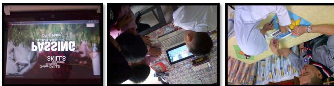
Figure 2: Learning Activities