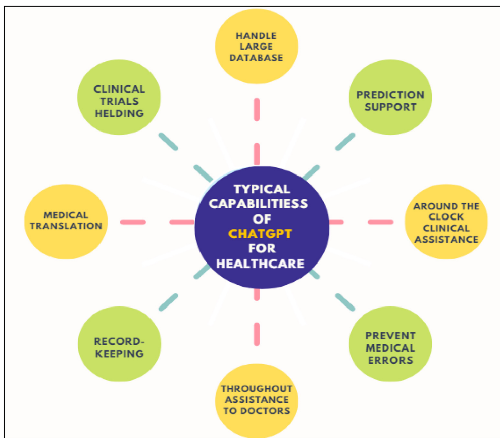
Fig. 2. Typical capabilities of ChatGPT for the healthcare sector.

be very beneficial for enhancing one's knowledge and abilities. Using ChatGPT, medical students may ask questions, get rapid feedback, and get solutions suited to their requirements. The use of ChatGPT may aid students in understanding and remembering what they are learning [51–53].