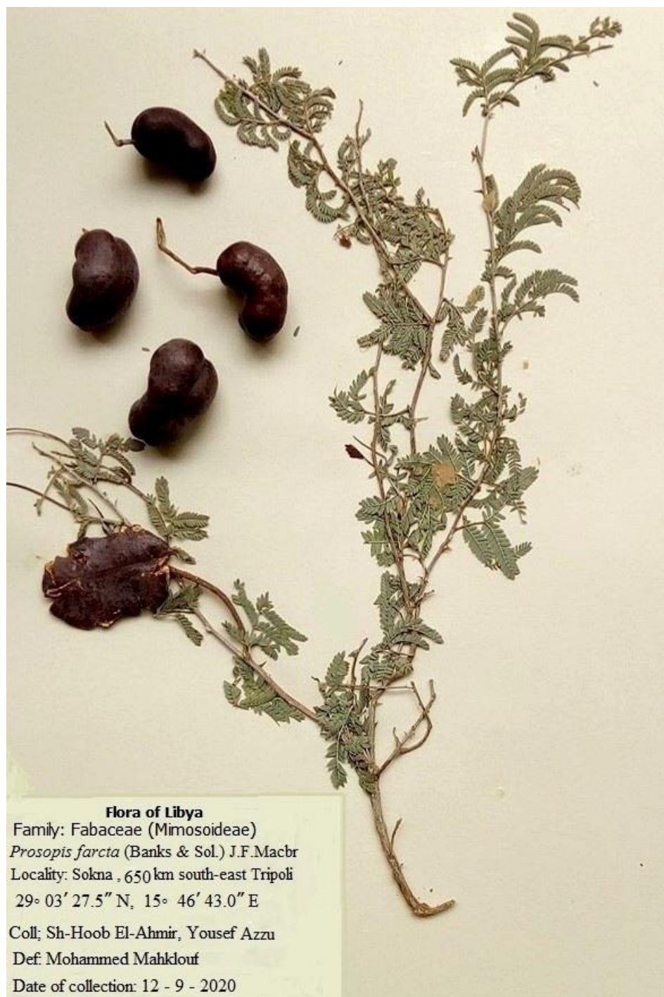
Figure 3. Herbarium specimen of Prosopis farcta . collected from Sokna region in Libya.