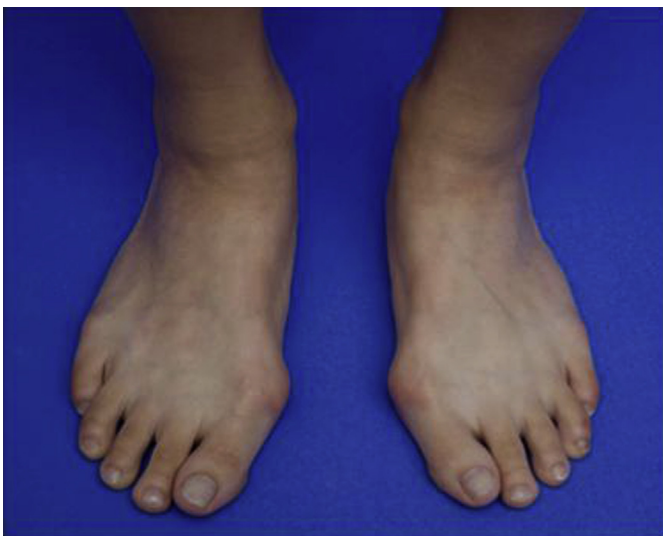
Imagine your self like Jane:

Data presented as mean ± standard deviation or n (%).