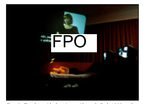
Fig. 2. Eija-Liisa Ahtila, Anne, Aki and God , 1998, video installation, color, audio, 7 tapes, each 30 minutes looped.

6.When does intervention change the work of