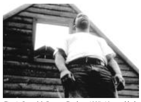
Fig. 1. Steve McQueen, Deadpan , 1997, 16 mm blackand-white film/video without sound, transfer red to glass laser disc; running time 4 minutes, 35 seconds edition.

moment from an American silent film of the 1920s. Playing the central character, he reenacts a shot in a Buster Keaton comedy, Steamboat Bill Jr. , in which Keaton stands immobile as four walls of a house come crashing down around him, then emerges unscathed. McQueen reverses this process. The loop, replaying the same moment, shot from different angles, repeatedly for four minutes, refuses the forward movement of narrative continuity and exposes the discontinuous fragmentation of reality. The speed at which the frame house collapses around McQueen increases toward the end of the film, suggesting a dramatic climax that is never realized (Riley et al.1999,134).