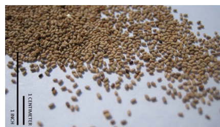
Figure 3. The fecal pellets produced by drywood termites are elongate with rounded ends and have six flattened or roundly depressed surfaces separated by six longitudinal ridges. Ruler in image is in inch and centimeter increments.