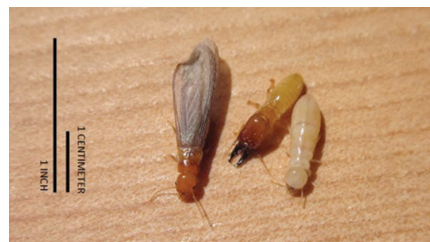
Figure 1. Western drywood termite, Incisitermes minor . Starting on the left side of image are swarmer (alate, reproductive), soldier, and worker. Ruler in image is in inch and centimeter increments.

During a structural inspection for drywood termites, inspectors look for feeding damage, shed wings, fecal pellets, and kickout holes, i.e. small holes (less than 2mm in diameter) through