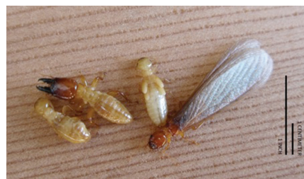
Figure 2. Nevada dampwood termite, Zootermopsis nevadensis . Starting on the left side of image are worker, soldier, nymph with wing pads, and swarmer (alate, reproductive). Ruler in image is in inch and centimeter increments.