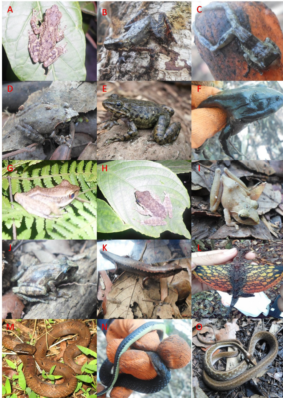
Fig. 3. Amphibians and reptiles present in Mt. Kalatungan Range National Park: Ansonia muelleri (A), Ansonia mcgregori (B), Philautus acutirostris (C), Rhacophorus bimaculatus (D), Limnonectes magnus (E), Limnonectes cf. feneri (F), Hylarana grandocula (G), Staurois natator (H), Philautus sp. 1 (I), Philautus sp. 2 (J), Pinoyscincus mindanensis (K), Draco volans (L), Psammodynastes pulverulentus (M), Cyclocorus lineatus (N), Rhabdophis auriculata (O).

of Mindanao. This species was observed on the rocks in the lower montane forest, with an elevation ranging 1200 to 1300 masl. It has an average SVL of 90.10 mm; HL of 35.08 mm; HW of 30.39 mm.