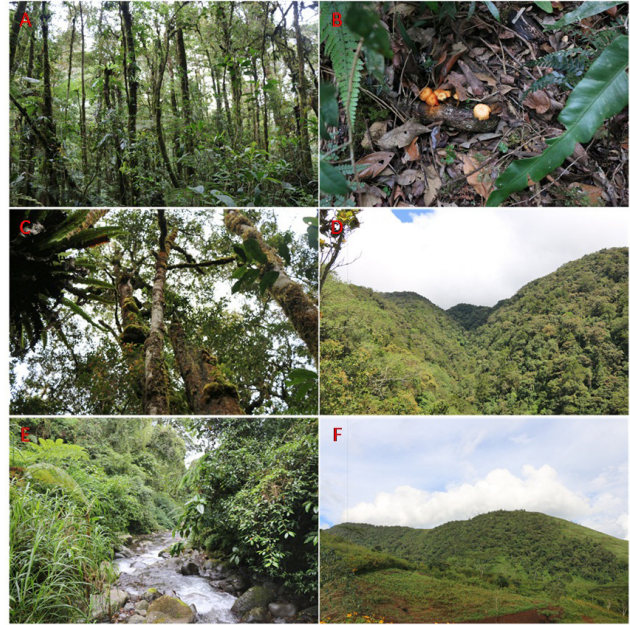
Fig. 2. Characteristics of sampling sites at the upper montane (A, B, C and D) and lower montane (E and F) forests.

The species has a synonym of Bufo muelleri (Boulenger, 1887) and reported to be found only in Mindanao and Dinagat Island, Philippines, hence referred as a Mindanao endemic (Warguez et al. 2013). It has green marks on the back side, two green bands in the forelimb and hind