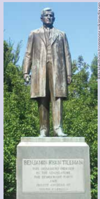
Statue of Benjamin Tillman on the grounds of the state capitol in Columbia, South Carolina, erected in 1940.