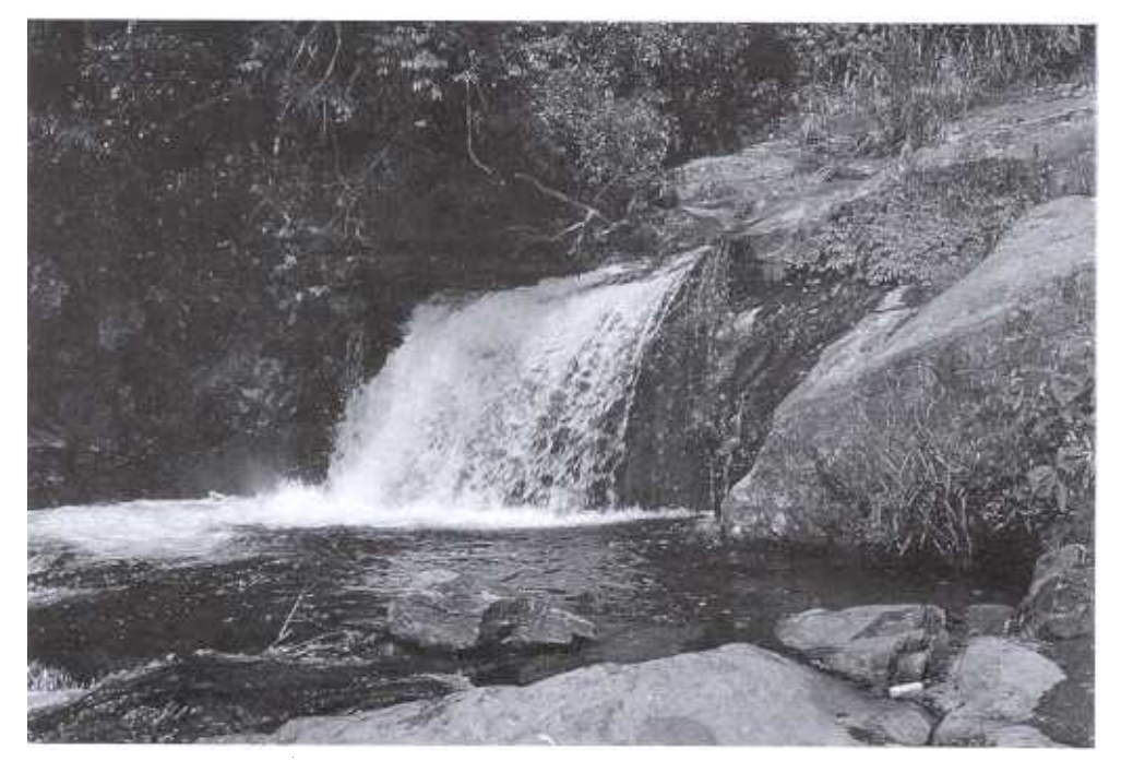
Fig. 2. Type locality of Amolops cremnobatus.

Ecological notes : All specimens were collected at a clear, rocky stream in disturbed evergreen rain forest. The specimens were on the wet rock face of a waterfall (Fig. 2) with the water column 20-30 cm from the rock. The bottom of the waterfall was about two meters below