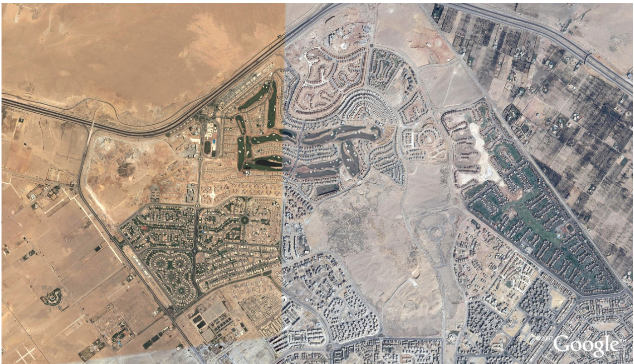
Fig. 6 – Gated communities and fragmented developments in the desert city of Sheikh Zayed.