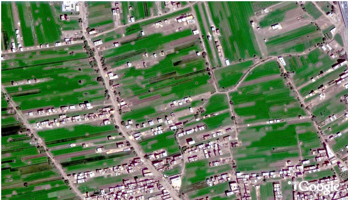
Fig. 3 – Incipient stages of sprawling upon agriculture lands in the north of Greater Cairo Region (GCR) abutting the ring road. (source: Google Earth)