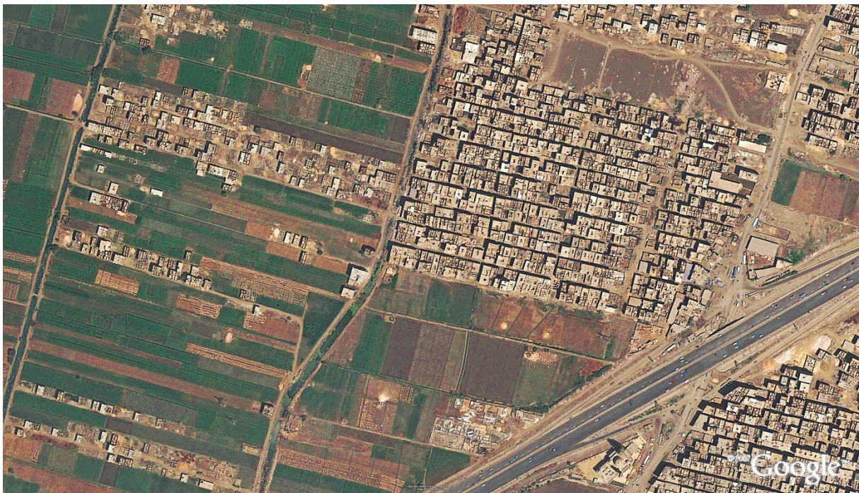
Fig. 4 – Older urban sprawling upon agriculture lands in the north of Greater Cairo Region (GCR) abutting the ring road.