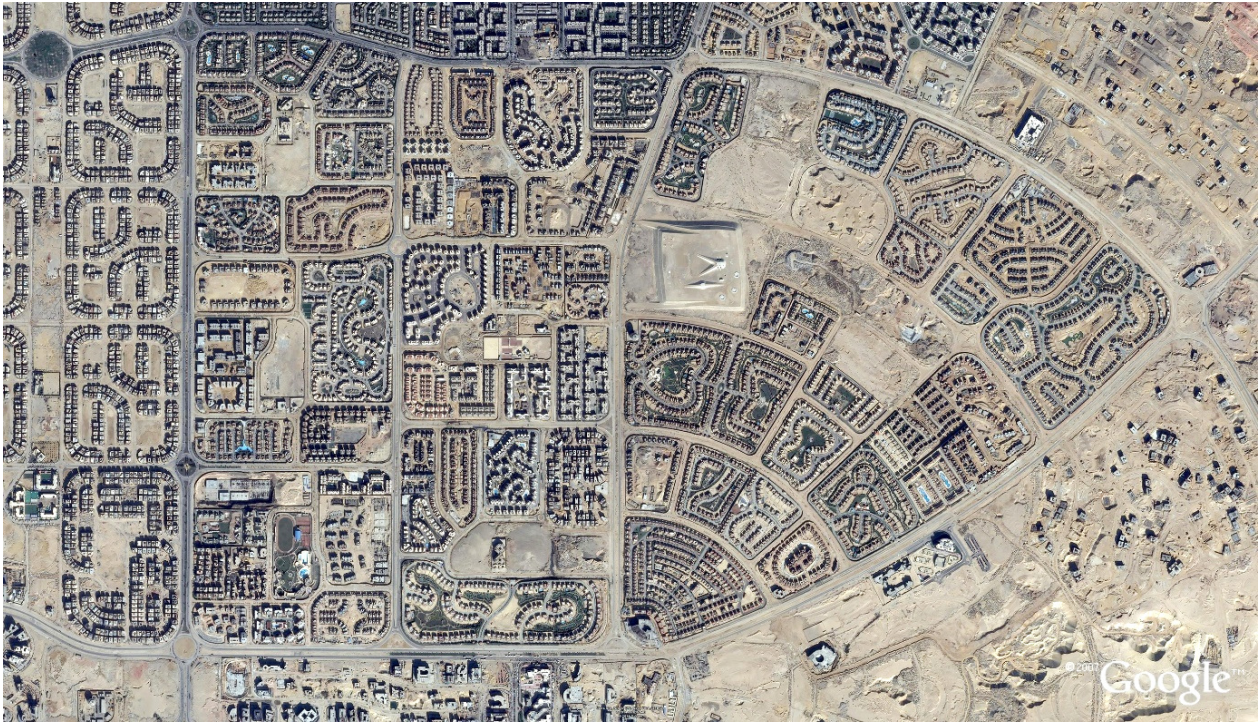
Fig. 5 – Gated communities in the desert city of New Cairo.