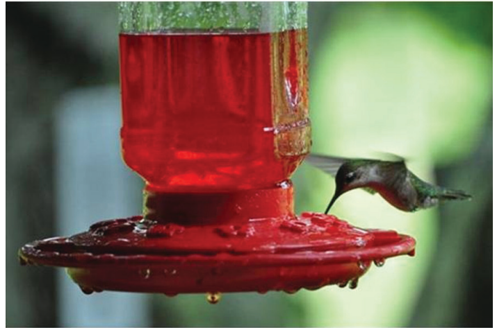
Figure 6. Nectar feeders come in a variety of shapes and sizes, but most feature plenty of red, since this is a very attractive color to hummingbirds.

feeding ports. Nectar feeders must be frequently cleaned because the sugar water they contain rapidly ferments and poses a serious threat to feeding birds. See cleaning section below for cleaning instructions.