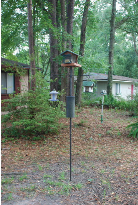
Figure 8. A baffle should help keep squirrels away from your feeders.

of jumping up to 10 feet. If you store your supply of bird food outside, it is best to keep it in a securely closed metal container. Squirrels can chew through containers made even from heavy plastic.