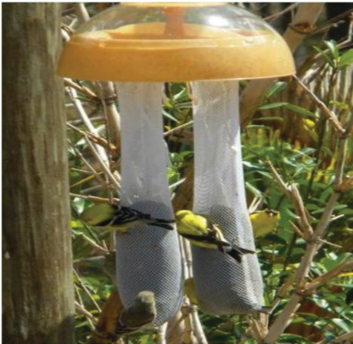
Figure 5. There are two general types of nyjer feeder, one, often referred to as a “thistle sock,” consists of a fine mesh bag.