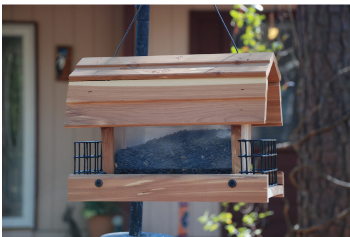
Figure 2. Hopper feeders typically resemble a small barn with Plexiglas sides.