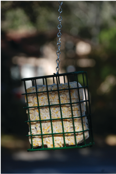
Figure 4. Suet feeders are generally a wire cage sized to hold a suet cake.