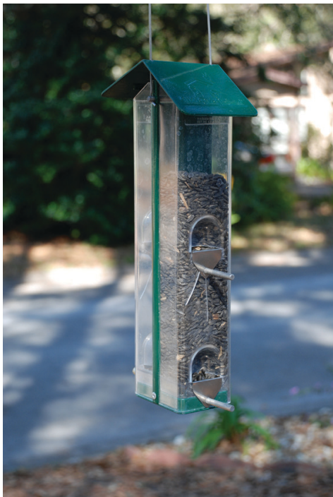
Figure 1. Tube feeders are typically comprised of a hollow cylinder, most commonly made of clear plastic or glass so the seed is clearly visible, with multiple feeding ports and perches.

resembles a small barn with clear plastic sides positioned in a V shape. These sides funnel the seed downward and out as it is eaten. Hopper feeders typically hold a lot more seed than other feeders and require filling less often. The quantity of seed they hold can attract squirrels, however. Hopper feeders attract all the same species as tube feeders, along with larger birds like blue jays, cardinals, grosbeaks, and woodpeckers.