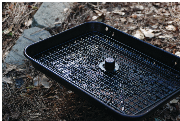
Figure 3. Platform feeders are comprised of a flat, raised surface on which seeds, fruits and other foods are spread.

care must be taken with platform feeders. This feeder type has been cited in studies as having a higher rate of disease transmission among birds because their droppings collect on the platform and mingle with the food. To reduce the risk of disease transmission, use a platform feeder with a wire mesh bottom to allow droppings to be washed away during rain. Platform feeders located close to the ground can be used to attract a slightly different bird audience that includes ground feeding doves, juncos, blackbirds, towhees and sparrows. Platform feeders located higher above ground will attract many of the birds that visit tube and hopper feeders.