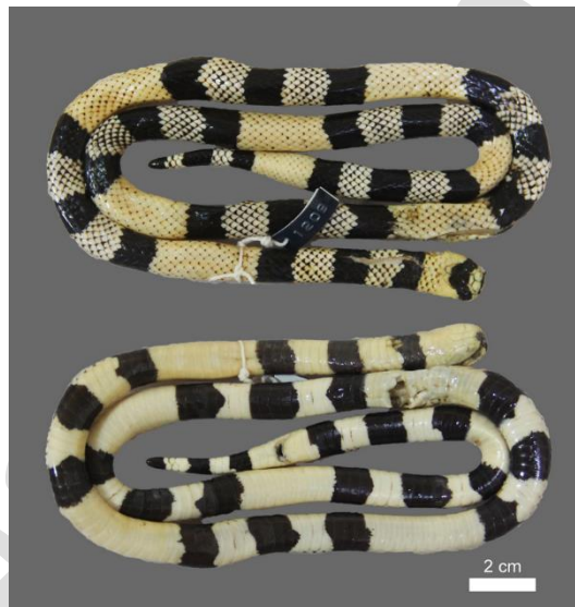
Figure 1. Specimen of Micrurus ibiboboca (MZUFV 1209) from Fazenda Limoeiro, Almenara, state of Minas Gerais, Brazil.

Micrurus ibiboboca is a terrestrial species, occurring in forest and open areas, even in disturbed areas, and is active during both night and day (Argôlo 2004). These habits increase the chance of encounters with humans, particularly in rural areas. However, there are a few records of snakebites caused by M. ibiboboca , as for Brazilian venomous coral snakes in general, probably due to their low aggressive behavior, small fangs, and limited angle of mouth opening (Bucaretschi et al. 2016).