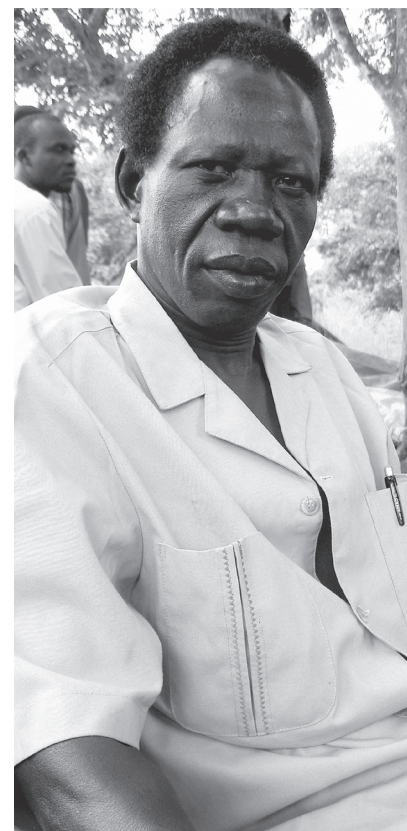
LRA Second-in-Command Vincent Otti, Ri-Kwangba, September 2006

In the mid-1990s, Eastern Equatoria was at the frontline of the Sudanese civil war. The SAF controlled the areas of Magwi, Parajok, Torit, and Owiny-Kibul with the help of their aligned militias. The LRA became a constant threat