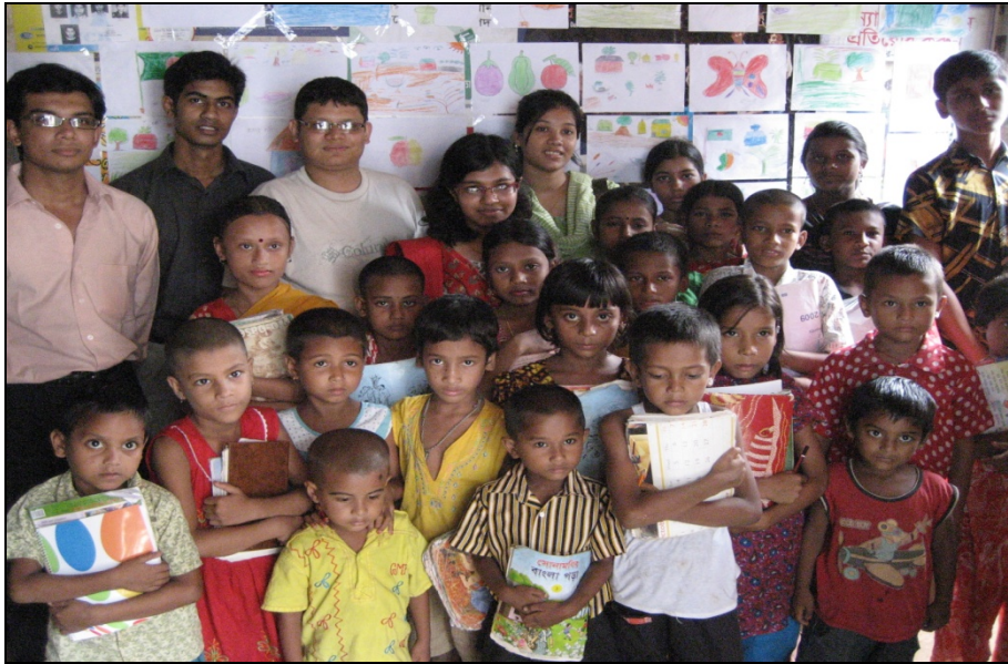
Bangladesh: YCs running classes for street children