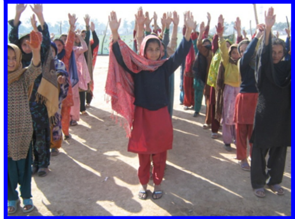
Pakistan: Young Champions encouraging IDP girls to attend schools