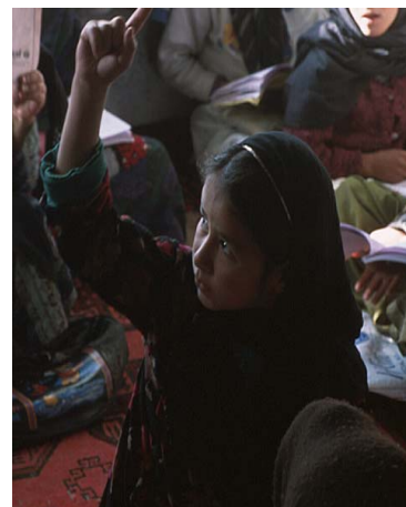
Afghanistan: Girls attending class