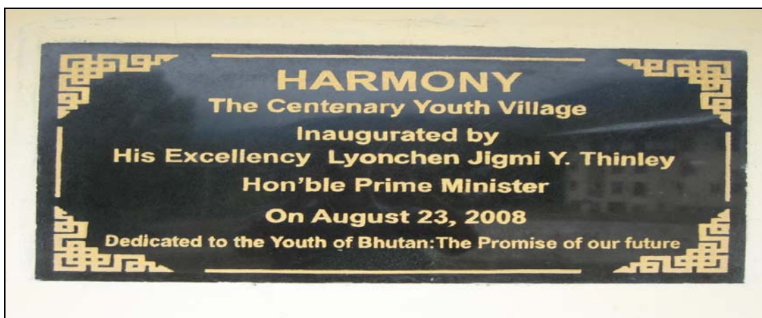
Bhutan: Youth Centre

The Consultant assessed that despite the Young Champions' own professional challenges and lack of resources, they were able to do a commendable job of fulfilling their mandate as advocates and spokespersons for gender equality and girls' education in their communities, including their role focusing on the prevention and management of HIV and AIDS, substance abuse and other issues according to the context of Bhutan.