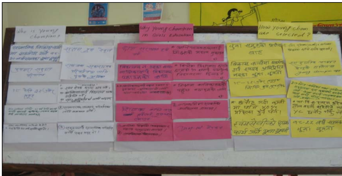
Nepal: Glimpses of ToT of Young Champions

Nepal is one of the best models for the YCs in South Asia to adapt or replicate in their own countries. The successful partnership of YCs, UNICEF Nepal Country Office and the Ministry and Department of Education is having a positive impact on the improvement of girls' education in Nepal.