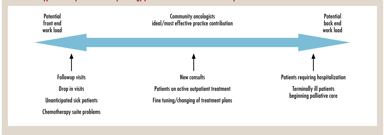
FIGURE 1: A hypothetical optimal community oncology practice model — the continuum of practice