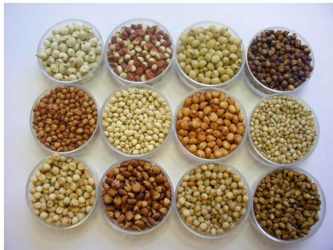
Figure 1. Example of the diversity of sorghum grains.

Sorghum [ Sorghum bicolor (L.) Moench] is a grass, native from Africa [7], from the same family (Poaceae) of the four most important cereals: maize ( Zea mays L.), wheat, rice ( Oryza sativa L.), and barley. Fifth most produced cereal in the world (61 million tons) [8], sorghum ranks second among the cereals grown in semi-arid regions [9]. In a generally way, 40% of this production is a staple food [10], and the rest is used for industry, alcohol, and feed. Feed sorghum is usually cheaper (10 to 15%) than maize, thus replacing it very efficiently [11]. In addition, its flour may be used alone or together with others traditional flours in many foods, looking for reducing the food price.