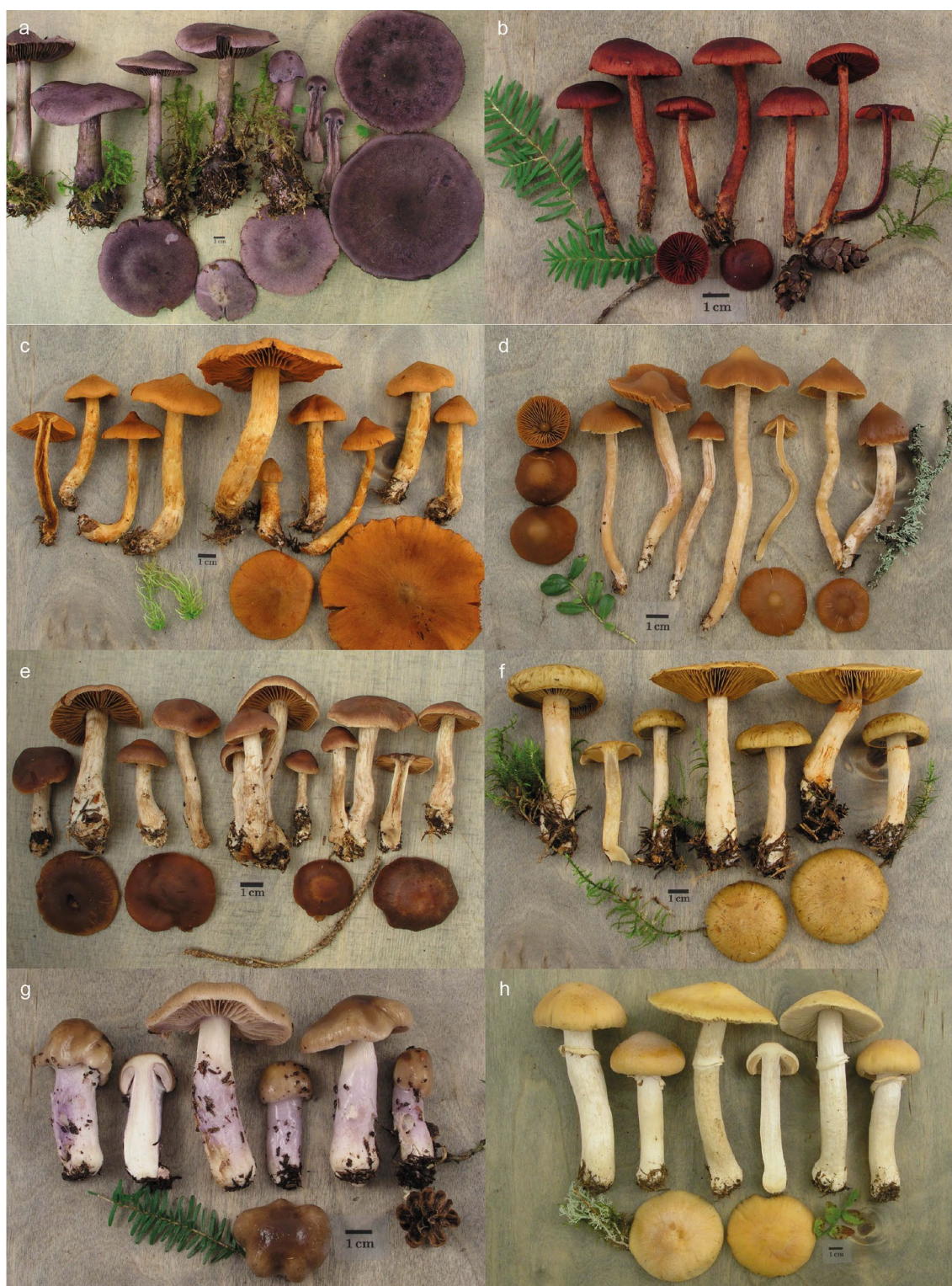
Fig. 3 Photos of the representatives of genus Cortinarius . A. C. subgen. Cortinarius , C. harynicus TN 04-525 (H), B. C. subgen. Dermocybe , C. neosanguineus TN 09-130 (H), C. subgen. Orellani , C. rubellus TN 05-024 (H), D. C. subgen. Iodolentes , C. mammillatus

TN 06-249, E. C. subgen. Telamonia, C. badiolaevus TN 04-960 (H), F. C. sect. Subtorti, C. subtortus TN 05-021 (H), G. C. subgen. Myxaciium, C. seidliae TN09-063 (H), and H. C. subgen. Paramyxiacium, C. caperatus TN 06-149 (H).