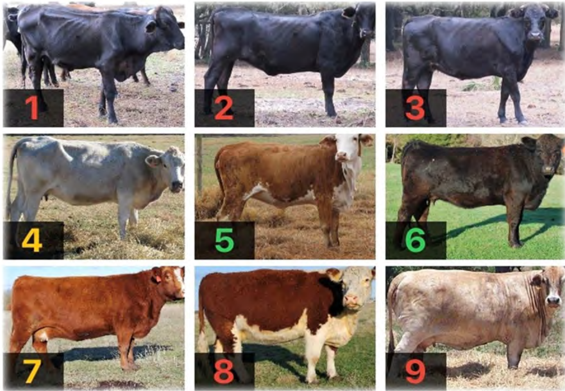
Fig. 1: Physical appearance of beef cattle with the respective BCS values from 1-9

A detailed description of BCS was based on four main criteria, thin (BCS of 1 and 2), borderline (BCS of 3 and 4), borderline condition average (BCS of 5 and 6), over-conditioned (BCS of 7 and 8) and too fat (BCS of 9)