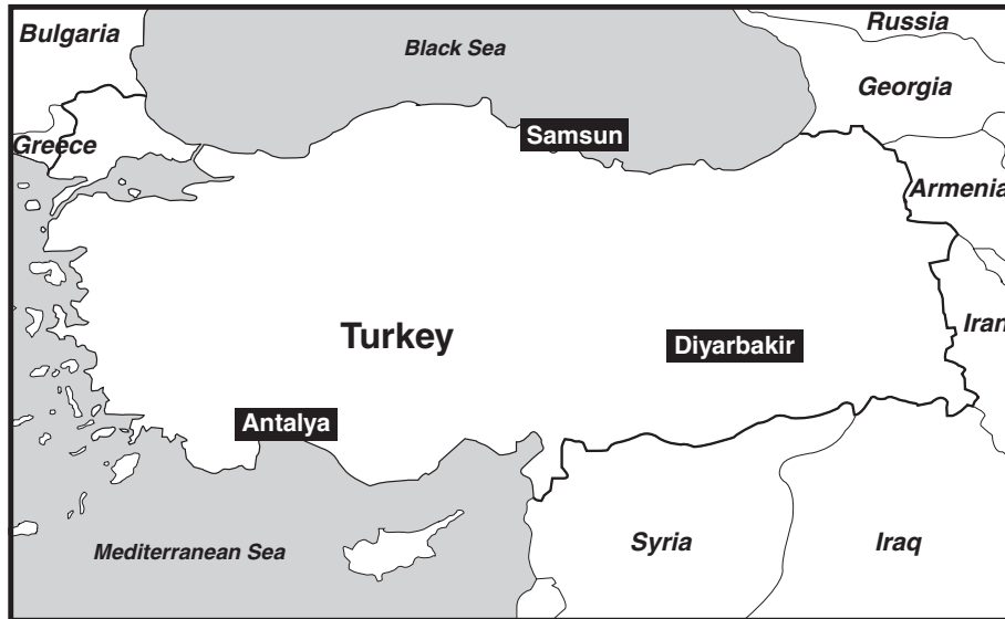
Fig. 1. Location of three selected provinces in Turkey.

Antalya, Diyarbakir, and Samsun between February 2000 and October 2001 (Fig. 1). Antalya is an area of tourism in the Mediterranean Region. Diyarbakir, which is in the East Anatolian Region of Turkey, is a province whose socio-economic level is low. Samsun, which is in the Black Sea Region of Turkey, is one of the developed provinces of Turkey. The provincial health directorates of these provinces randomized eight health centers for Antalya (four were from rural areas and four were from urban areas), eight health centers for Diyarbakir (four were from rural areas and four were from urban areas) and 10 health centers for Samsun (five were from rural areas and five were from urban areas). The study group consisted of 2,465 randomly selected healthy subjects aged 6 months old or above in three provinces. Surveys were carried out in three steps: physical examination, interview, and blood collection (Fig. 2).