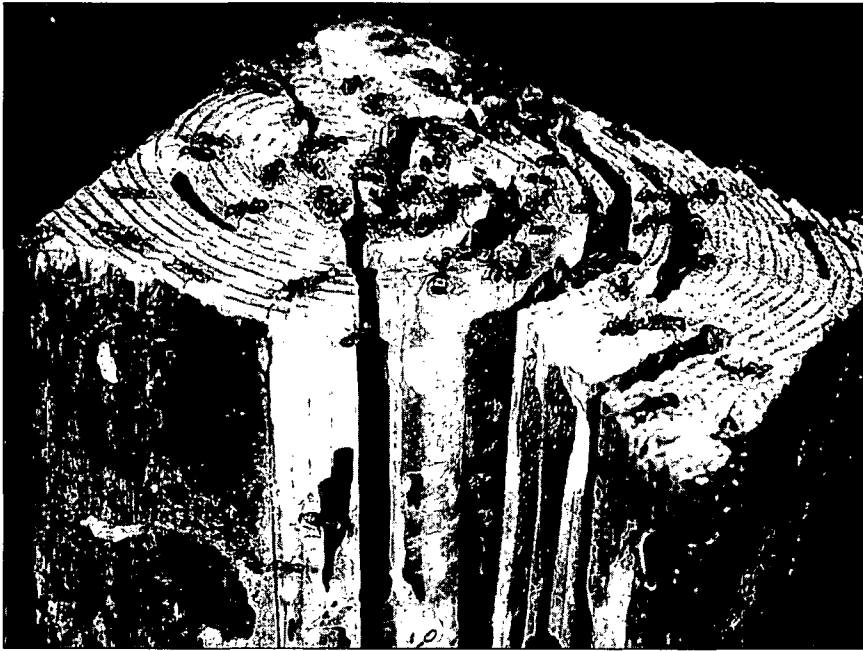
Figure 1. Structural beam infested with Camponotus modoc .