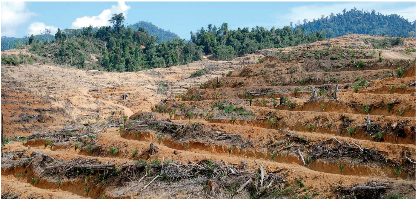
The unstoppable oil palm? Oil palm is a tropical crop that presents the highest yield per hectare of oil-producing crops in the world. New high-yielding varieties could spare land for forests worldwide or could increase tropical deforestation as oil production is transferred to the tropics. The image shows land cleared for oil palm plantation in Malaysian Borneo.