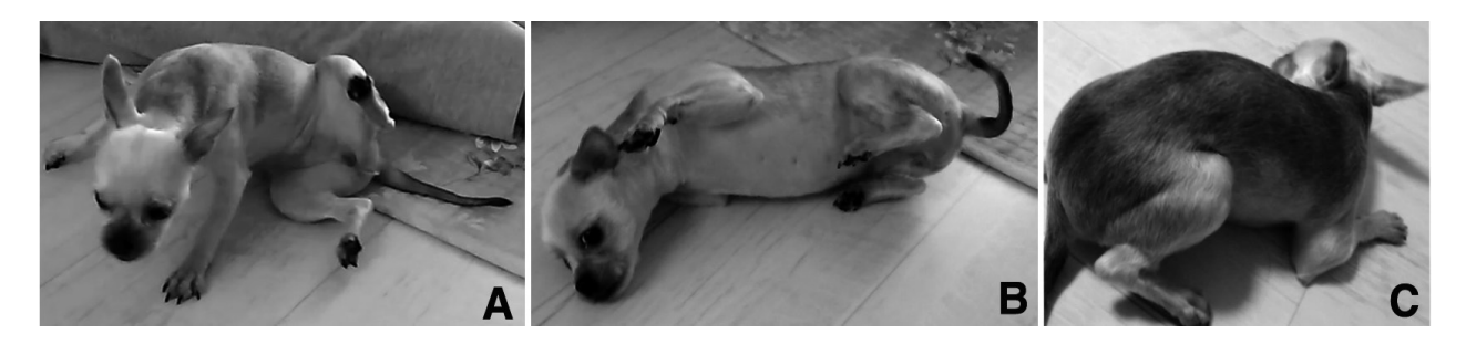
Fig. 1. Clinical appearance of episodes (A, B and C). Muscle contraction and stiffness started from the hind limbs (A) and involved in the forelimbs (B). The patient was conscious and responsive to the owner (B). Arching of the lumbar spine was detected (C).