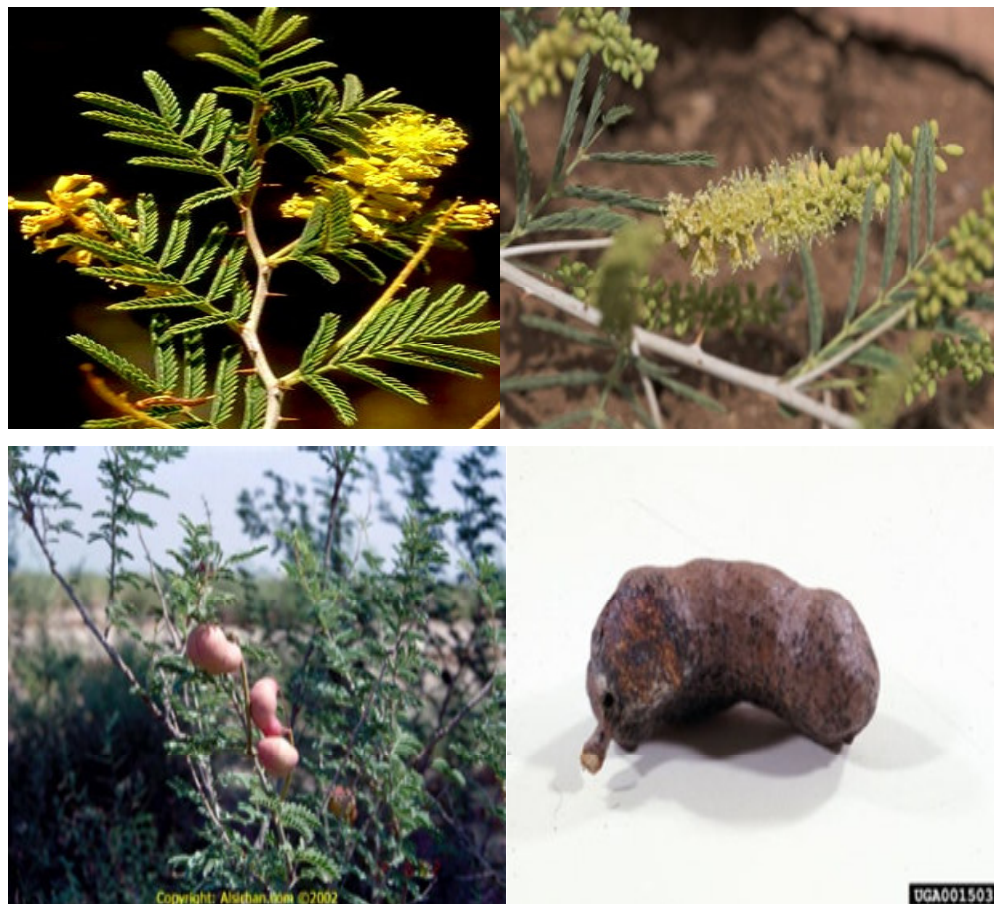
Figure 1. P. farcta flowering and fruit.

dosage of P.F.P.E, the bath solution was changed. Waiting for 10 min and returning the aorta tonicity to the basic state, phenylephrine and then the new dosages of P.F.P.E was added. For evaluating the role of nitric oxide (NO) on the effect of plants extraction, the percentage of aorta relaxation was firstly measured for the dosages of 1 and 2 mg/ml of P.F.P.E and 5 min after adding the 100 \mu m of nitric oxide synthetase inhibitor (L.NAME), the percentage of aorta relaxation was measured again (Kim et al., 2000). To see if the P.F.P.E had a cholinergic effect, some groups of aorta with the endothelial layers were firstly contracted with 1 \mu m of phenylephrine. Then the percentages of aorta relaxation due to 1 mg/ml of P.F.P.E, at the presence of 1 \mu m of atropine (Legssyer et al., 2002) were measured in each group.