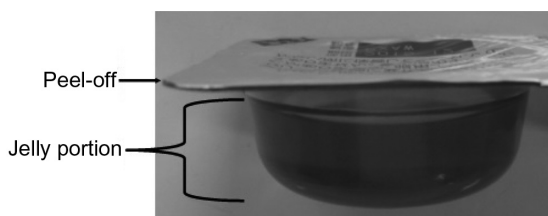
Figure 1 Oral jelly formulation: single-serving type.

A dissolution test and bioequivalence study, in accordance with the Japanese Guideline on Bioequivalence Assessment for Development of Additional Formulations and the Japanese Guideline for Bioequivalence Studies of Generic Products, were carried out to evaluate the bioequivalence of alendronate oral jelly 35 mg to the alendronate oral tablet 35 mg. 27 In the dissolution test, the dissolution profiles of both formulations satisfied the criteria for judgment of similarities