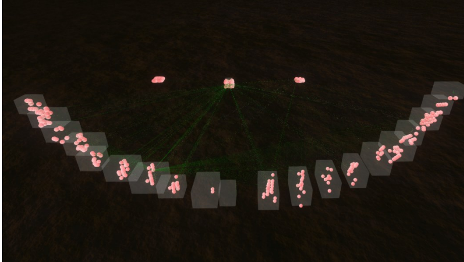
Fig. 3. Overview of a set of groups of groups of entities arranged into a constellation.

data-shape (see Figure 3), adding additional dimensions for potential additional data encoding.