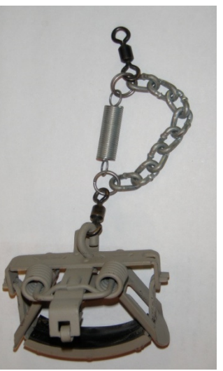
Figure 2. Victor Oneida #1 leg-hold live trap showing chain, spring, and swivel setup as used on the San Nicolas Island feral cat eradication campaign.

Based on a trial study conducted by Island Conservation (IC) on SNI in 2006 using leg-hold traps, trap aversion by the island fox was demonstrated while trapping for cats (Island Conservation, unpubl. data). Foxes essentially became trap shy post-capture. Trap alterations and methodologies intended to reduce the risk of injury to foxes were incorporated and tested. This 20day trial consisting of 784 trap-nights, demonstrated that modifications to the trap and trap sets produced few injuries to foxes and that those injuries were typically minor. A total of 64 foxes (41 separate individuals) were captured, with only 1 individual requiring veterinary attention. Fourteen cats were removed during the trial. Trap modifications included shortening and changing the type of anchor chain, the inclusion and positioning of two large barrel swivels (one more than the standard), and the addition of a more flexible shock absorbing spring (Figure 2).