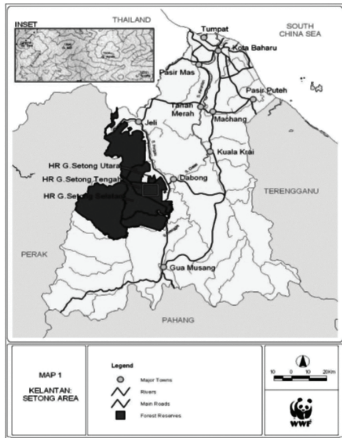
Figure 1. Map of the study area (Source: WWF-Malaysia, 2009).