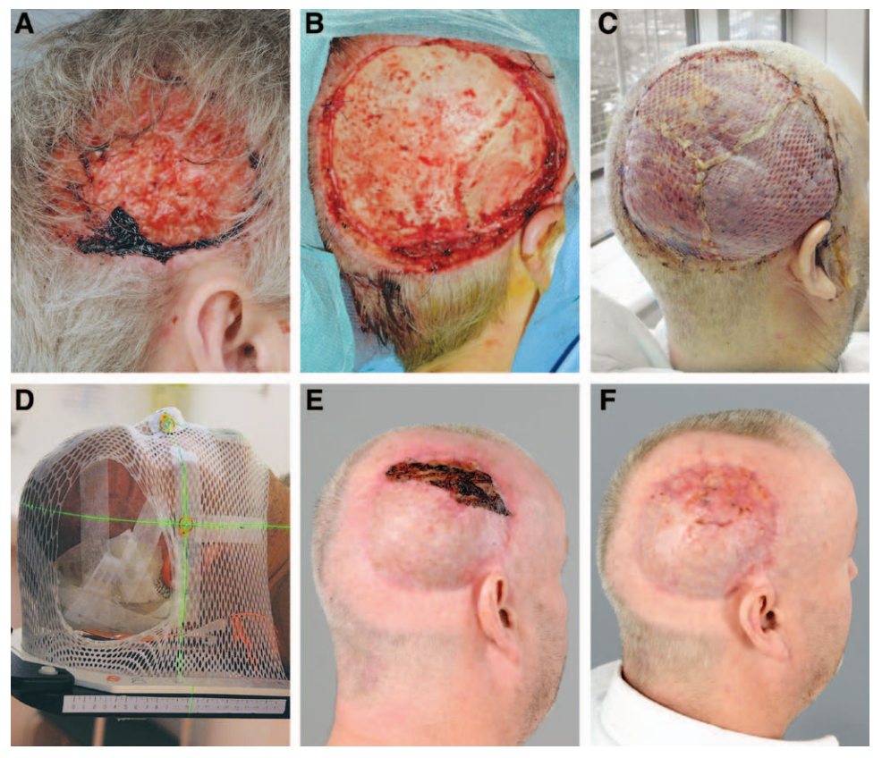
Fig. 1. A, The preoperative view of the giant basal cell carcinoma on the right side of the scalp. B, The preoperative view of the resulting skull defect after the excision. C, The scalp defect reconstructed using a latissimus dorsi muscle free flap, microsurgically anastomosed to the superficial temporal vessels. The muscle was covered with a split-thickness skin graft. D, Postoperative radiotherapy. E, The scalp reconstruction with the superficial skin necrosis. F. The result 12 mo after treatment.

Five weeks after reconstruction, the patient was referred to the Department of Oncology, Herlev Hospital, for scalp radiotherapy. Over a period of 3 weeks, the patient received 51 Gy in 17 fractions of 3 Gy using electron field (Fig. 1D).