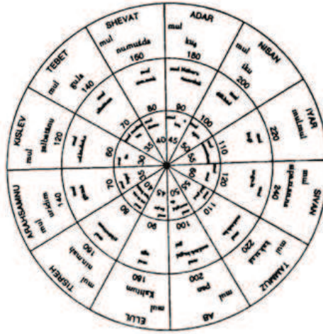
Fig. 3. A reconstruction of a Round "Astrolabe"

In Table 1 the Acadian words are written phonetically and marked in italics; the Sumerian words and ideograms are represented by capital letters in accordance to the Gesman dictionary.