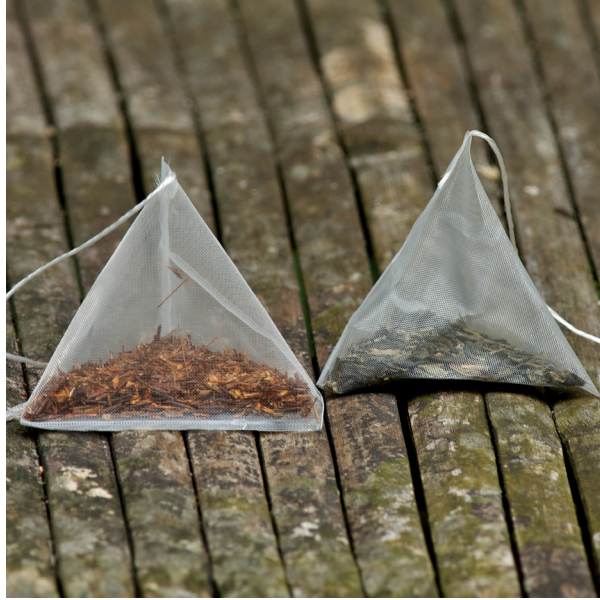
Fig. 1. Tetrahedron-shaped synthetic tea bags used for Tea Bag Index (TBI) experiments.

ments (Berg et al. 1993; Trofymow et al. 2002; Parton et al. 2007). Testing the current generation of climate models with the litter decomposition data obtained from these studies (Bonan et al. 2012) revealed that there is a strong need for higher resolution measurements with a global coverage to increase the predictive power of such models (Bonan et al. 2012; Stockmann et al. 2013).