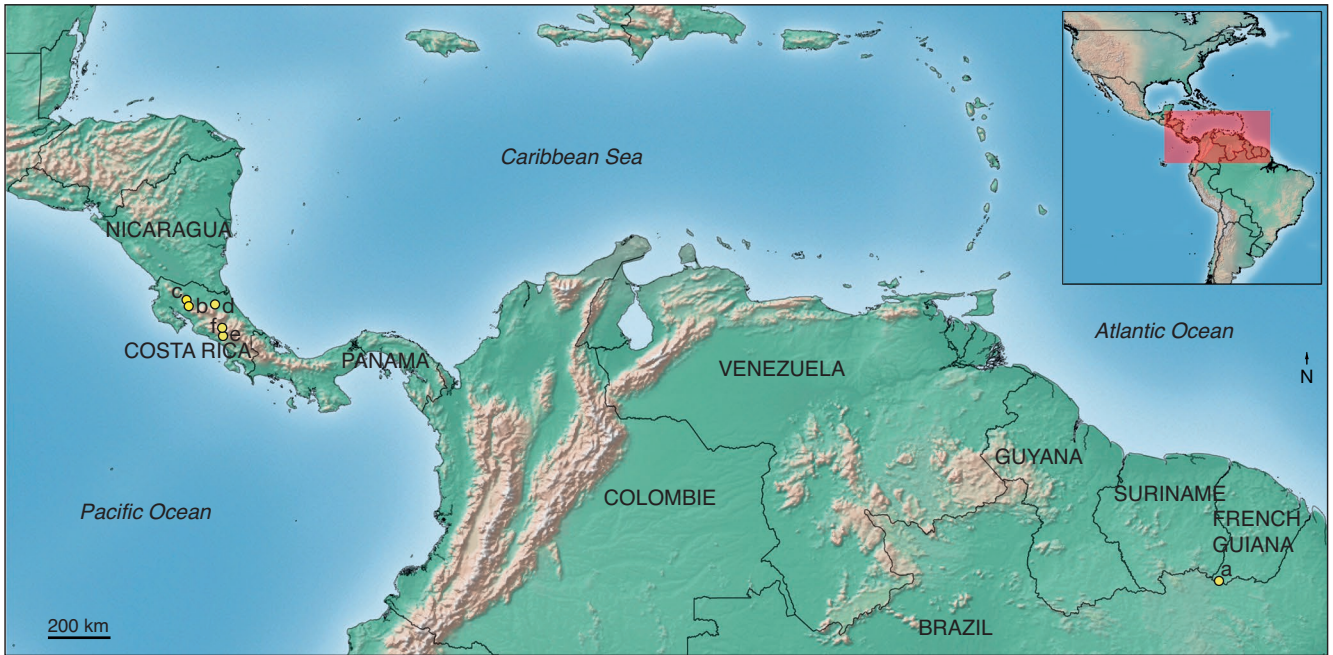
FIG. 1. — Sites in Costa Rica and French Guiana sampled for Diptera during entomological surveys in 2015: a , Mitaraka (French Guiana); b , Estación Biológica Monteverde (Santa Elena); c , rainforest of Chalet Nicholas near Parque Tenório Reserva (Nuevo Arenal); d , OTS-Estación Biológica La Selva (near Puerto Viejo de Sarapiquí); e , Dantica Reserva Forestal Privada – Los Santos Reserva Forestal and the Savegre Reserva Natural (San Gerardo de Dota); f , Parque Nacional Tapantí (near Orosí).