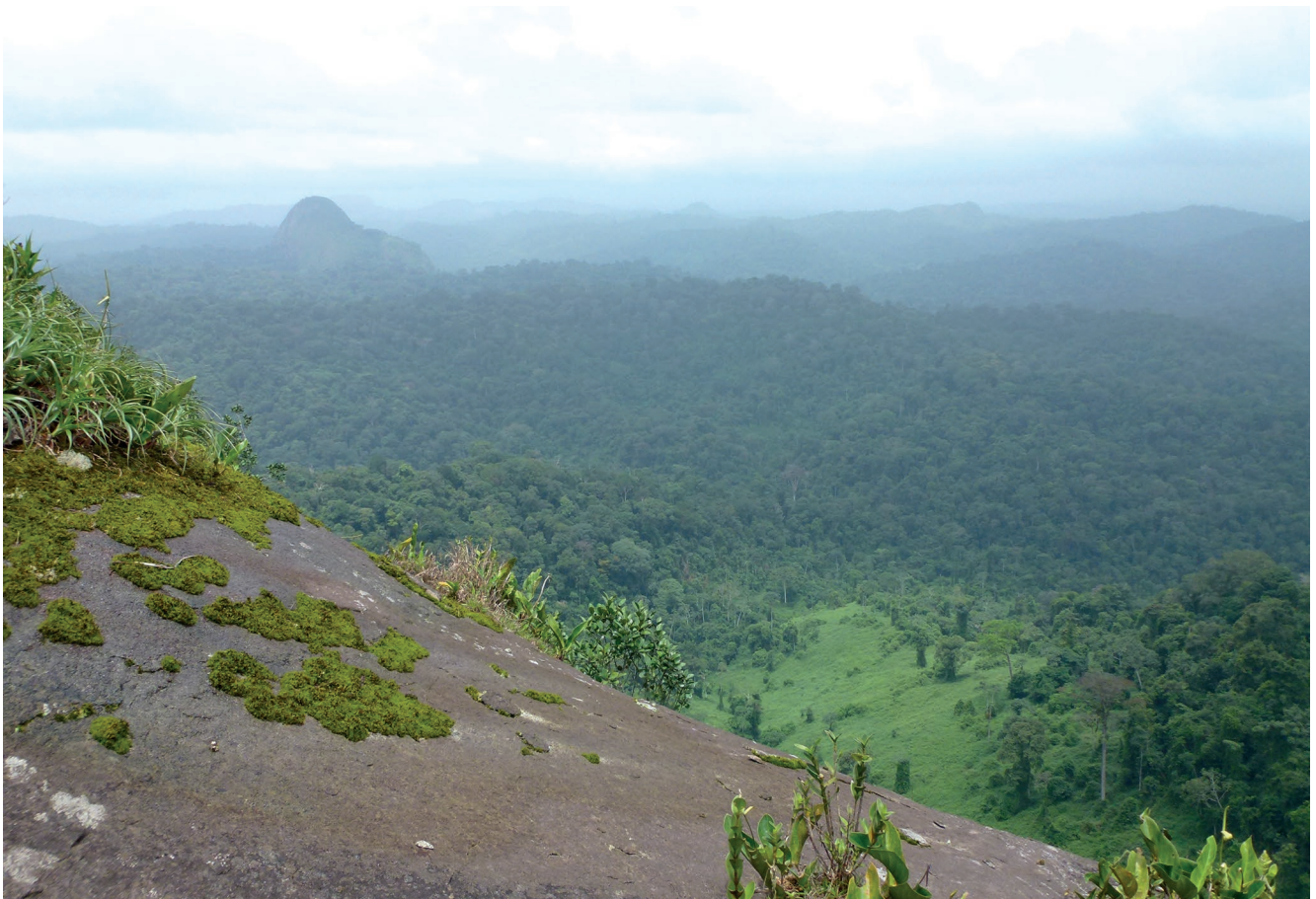
FIG. 2. — View of lowland rainforest and inselbergs from the inselberg Sommet en Cloche (Mitaraka mountains, French Guiana).