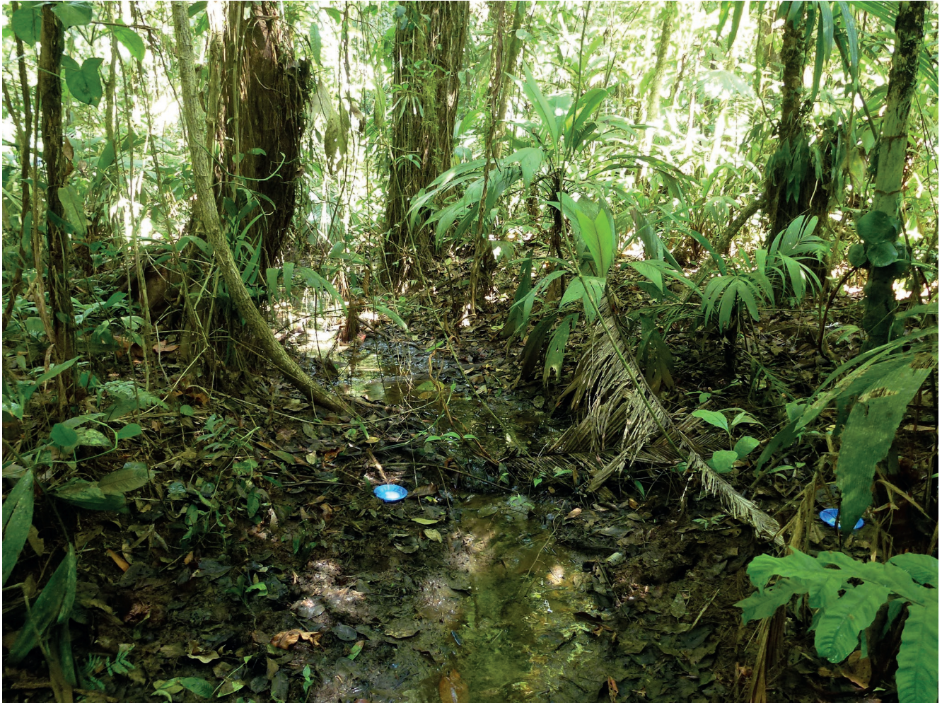
Fig. 3. — Blue pan traps in swamp site LS-SW2 in OTS – Estación Biológica La Selva (Costa Rica).

30 researchers explored the area. A third, smaller team returned to the site from 12 to 20.VIII.2015. One of us (MP) acted as coordinator of the collected Diptera and was also the only Diptera worker actively involved in this expedition.