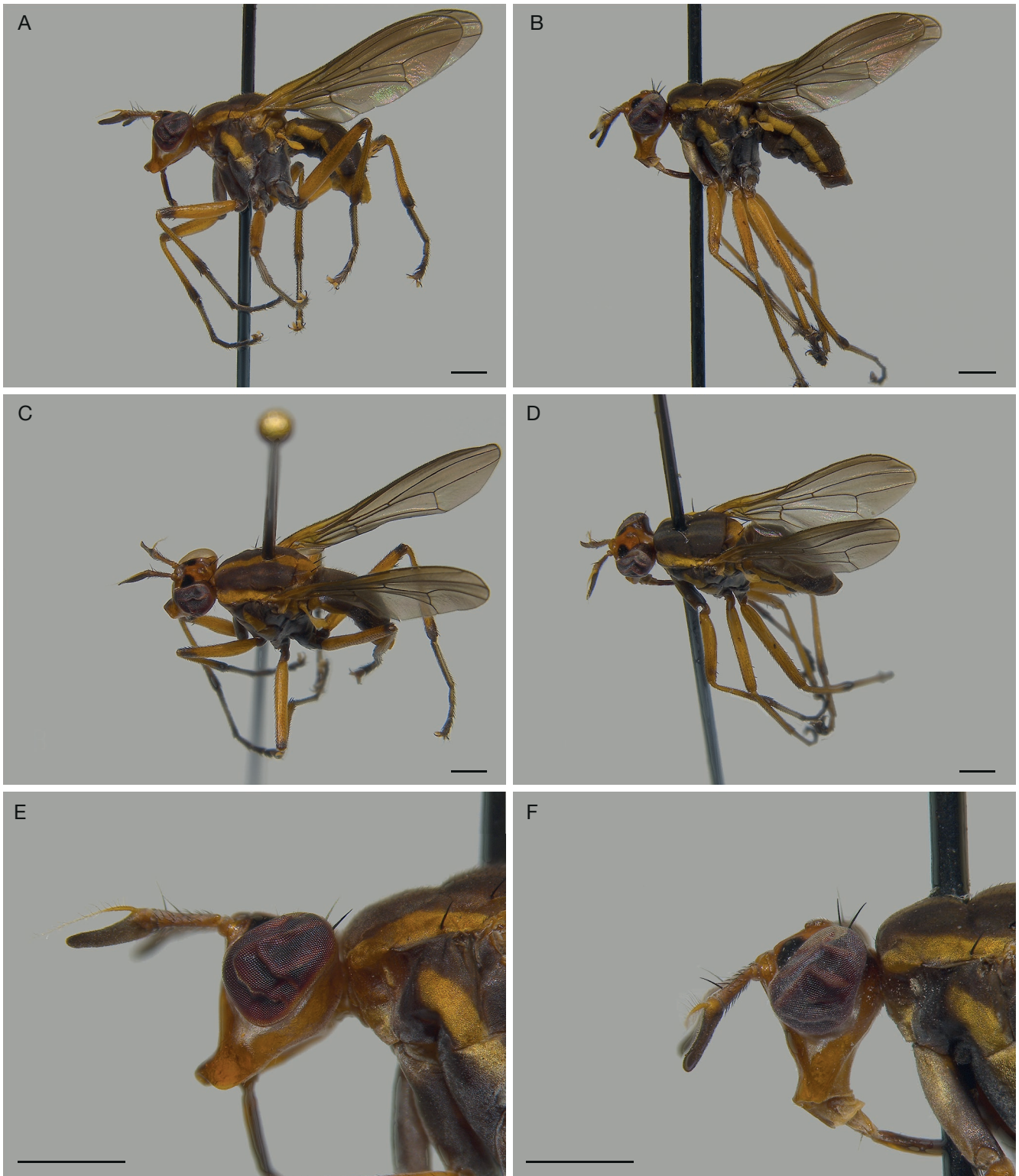
FIG. 4. — A, C, E , ♂ Thecomyia chrysacra Marinoni & Steyskal, 2003: A , habitus, lateral view; C , habitus, dorsolateral view; E , head, lateral view; B, D, F , ♂ holotype of Thecomyia dideriki Mortelmans n. sp.: B , habitus, lateral view; D , habitus, dorsolateral view; F , head, lateral view. Scale bars: 1 mm.

site MIT-D-RBF, 02°13'58.8"N, 54°27'07.5"W, 317 m, on vegetation along muddy trail and in swamp, 6.III.2015, sweep net, MP leg., sample code: MITARAKA/075, deposited as an intact, dry, pinned specimen, coll. JM. 1 ♀, Mitaraka, site MIT-DZ-RBF2, 02°13'59.3"N, 54°27'00.3"W, 283 m, tropical wet forest (bas fond), 28.II-5.III.2015,