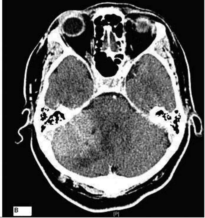
Fig. 1. (A) Coronal computed tomography (CT) scan with contrast showing an extra-axial enhancing mass lesion involving the right cerebellopontine angle overlying the cerebellar hemisphere and with mild mass effect. (B) Axial CT scan with contrast demonstrating a well-circumscribed right infratentorial homogenously enhancing well-defined lesion adjacent to the dura.