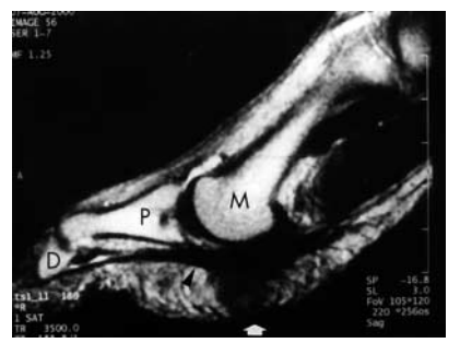
Figure 2 MRI, T2-weighted image; D, distal phalanx; M, metatarsal bone; P, proximal phalanx.

Plantar fibromatosis (Ledderhose disease) is a benign but infiltrative neoplasm, and is a slow growing nodular thickening that occurs most often within the central band of the plantar aponeurosis. MRI is especially useful in planning surgical treatment by showing the exact location and extent of the lesion.