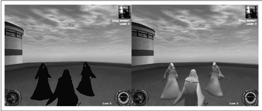
Figure 1. Virtual group discussions with black- and white-cloaked avatars

and the majority of them were native English speakers. The mean age of the participants was 19.84 ( SD = 2.61 ). Participants had spent ample time using personal computers ( M = 10.16 years, SD = 2.85 years), but video game experience in the sample was lower on average ( M = 4.68 years, SD = 5.74 years). All participants were assigned to three-person virtual groups ( N = 17 ) and communicated exclusively via text messages sent within the virtual reality.