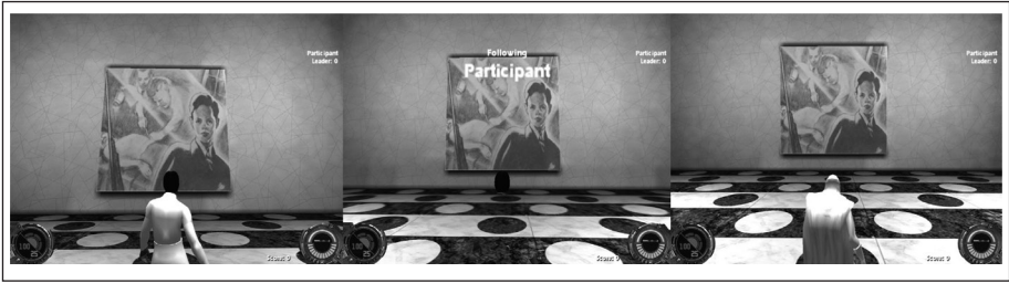
Figure 3. TAT picture 8BM (boy and surgery) from the perspective of male participants using avatars in doctor, control, and KKK uniforms

After the training session, the participants were asked whether they understood the guidelines of the writing task and whether they felt comfortable when operating their avatar. If that was the case, they were invited to stroll along the museum's corridor and enter one of the two rooms housing each TAT picture. The presentation order of the pictures was alternated by the experimenter, who told participants which of the two virtual rooms to enter first. The experimenter advised the participants to stay in a picture room until the story was completed to avoid stories merging the attributes of both pictures, comparisons between pictures, and the like.