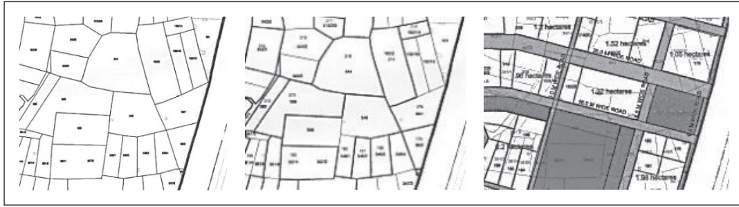
EXHIBIT 3—ORIGINAL LOTS TO FINAL LAYOUT WITH RECONSTITUTED LOTS