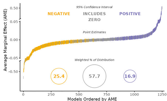
Fig. 1. Broad variation in the findings from 73 teams testing the same hypothesis with the same data. The distribution of estimated AMEs across all converged models ( n = 1,253 ) includes results that are negative (yellow; in the direction predicted by the given hypothesis the teams were testing), not different from zero (gray), or positive (blue) using a 95% CI. AME are xy standardized. The y axis contains two scaling breaks at \pm 0.05 . Numbers inside circles represent the percentages of the distribution of each outcome inversely weighted by the number of models per team.

Next, based on PNAS peer review feedback, we generated a list of every possible interaction pair of all 107 variables. Of these 5,565 interactions, 2,637 have nonzero variance and thus, were usable in a regression without automatically being dropped. Including 8 or more interaction variables plus their main effects (i.e., 24 or more variables, many that were cross-level interactions) led to