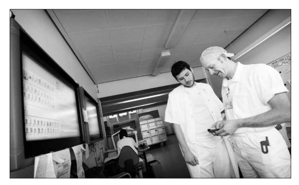
Fig. 3 The AwareMedia and the AwarePhone deployed and used for coordination of surgeries at an operating ward

Again – why does this project represent pervasive healthcare and not e.g. medical informatics? For a couple of reasons. First, because the project was conducting research into pervasive computing technologies. As stated in the introduction, pervasive healthcare operates on two flanks, where the one is core technology research into pervasive computing based on the challenges arising from e.g. healthcare. We are well aware that the technologies in Figure 3 in few years will look very bulky and very far from what I have described as "embedded interactive walls" inside a hospital. But again, we are also very convinced that this is a nice example of one of the first 'cars' within pervasive healthcare for hospitals. Second, because the systems were not concerned with medical information management, which in this case – would deal with operation planning, patient treatment, documenting surgery, estimating production, adminis-