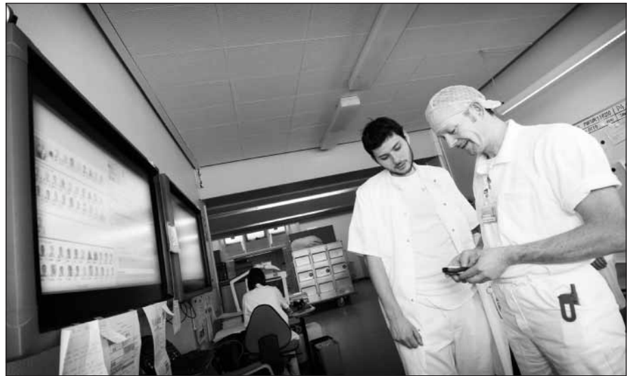
Fig. 3 The AwareMedia and the AwarePhone deployed and used for coordination of surgeries at an operating ward

Again – why does this project represent pervasive healthcare and not e.g. medical informatics? For a couple of reasons. First, because the project was conducting research into pervasive computing technologies. As stated in the introduction, pervasive healthcare operates on two flanks, where the one is core technology research into pervasive computing based on the challenges arising from e.g. healthcare. We are well aware that the technologies in Figure 3 in few years will look very bulky and very far from what I have described as “embedded interactive walls” inside a hospital. But again, we are also very convinced that this is a nice example of one of the first ‘cars’ within pervasive healthcare for hospitals. Second, because the systems were not concerned with medical information management, which – in this case – would deal with operation planning, patient treatment, documenting surgery, estimating production, adminis-