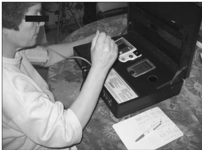
Fig. 2 A patient using the home-based monitoring system in a briefcase for monitoring her blood pressure