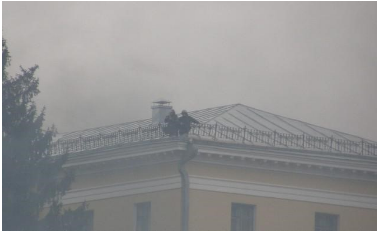
Photo 6. Maidan “snipers” or spotters on the roof of Zhovtnevyi Palace circa 10:00am during the massacre (Source, “Як працювали снайпери на Майдані,” February 24, 2014, OGO , http://ogo.ua/articles/view/2014-02-24/48170.html ).

Videos, photos, and testimonies of the protesters show that the Maidan protesters seized Zhovtnevyi Palace and that they controlled the entrance, the roof, and windows on the roof during the massacre. Three “snipers” on the roof of Zhovtnevyi Palace were filmed and identified as such from the Maidan stage during wave of killing of protesters at 9:59-10:00am. 222 But a full version of the video of the snipers was not released publicly. The same two “snipers” there were shown by ICTV and identified as such on February 20, 2014. 223 This study also located one of them in the same spot on the top of this yellow building in a BBC video at 10:05am, but his presence there was not previously reported. 224