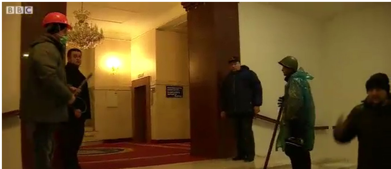
Photo 8. The leader of the Khmelnytsky regional organization of Svoboda party and Maidan protesters guard the entrance to the stairways and the elevators in the Hotel Ukraina during the massacre of the protesters by shooters from this hotel circa 9:51am (Source: “Бои в Киеве: снайперы, раненые и автоматные гильзы,” BBC Russian , February 20, 2014, http://www.bbc.co.uk/russian/multimedia/2014/02/140220_kiev_maidan_wounded_bbc ).

It would have been irrational for the Maidan leaders not to act on such information and deploy the armed Maidan groups to locate and detain or kill these snipers, who continued to massacre the Maidan protesters for a relatively long time period. This specifically concerns Parubii and Yarosh, who stated that they were during the massacre on the Maidan. But such actions become rational if these snipers were not from the government side or “third side” but from the Maidan side conducting a false flag operation. Such false flag operation to succeed in mass killing of the protestors required that it was conducted in secret not only from the government of Ukraine and its forces but also from journalists and the Maidan protesters, including many leading Maidan activists and many Maidan Self-Defense members and commanders with the exception of small minority, that included snipers, spotters, and their security. Specifically Parubii and Yarosh stated in media interviews that they were present during the massacre on the Maidan, but there is not a single publicly available video or photo showing their specific whereabouts and actions at the time of this mass killing. This is another dog that did not bark evidence indicating that the Maidan massacre was a false flag operation by a section of the Maidan leaders and a very small faction of the protesters.