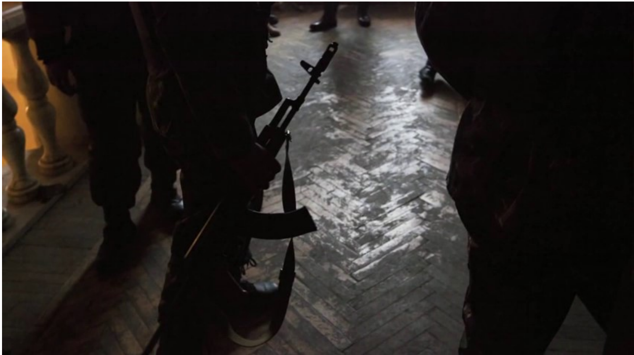
Photo 1. A Maidan shooter armed with a Kalashnikov assault rifle inside the Music Conservatory shortly after 8:00am around the time of mass shooting of the Berkut from this building.

Only fragmentary recordings of the live broadcasts and videos from this time period are publicly available, even though there were several such live Internet streams and TV broadcasts of this area of Maidan. 44 They include sounds of gunshots on Maidan during the night and in the morning before 9:00 am, as well as Berkut throwing Molotov cocktails at the second floor of the conservatory where the shooters were based. A STB news report briefly shows an apparent shooter there around 8:00am. 45 The BBC investigation includes photos showing Maidan shooters armed with hunting rifles and a Kalashnikov assault rifle inside the Music Conservatory shortly after 8:00am. (See Photo 1 and 2). Videos show several members of these police units carried out and put into ambulances some time before 9:00am on February 20. 46 An Interior Troops officer reports being injured by pellets in the Maidan area after 8:00am. In their radio communications, the Internal Troops units, stationed at Maidan near the Trade Union building, made urgent requests for an ambulance at 8:08am, a life support vehicle at 8:21am, an ambulance at 8:29am, two ambulances at 8:39am and five ambulances at 8:46am, before issuing retreat orders at 8:49 and 8:50am. 47