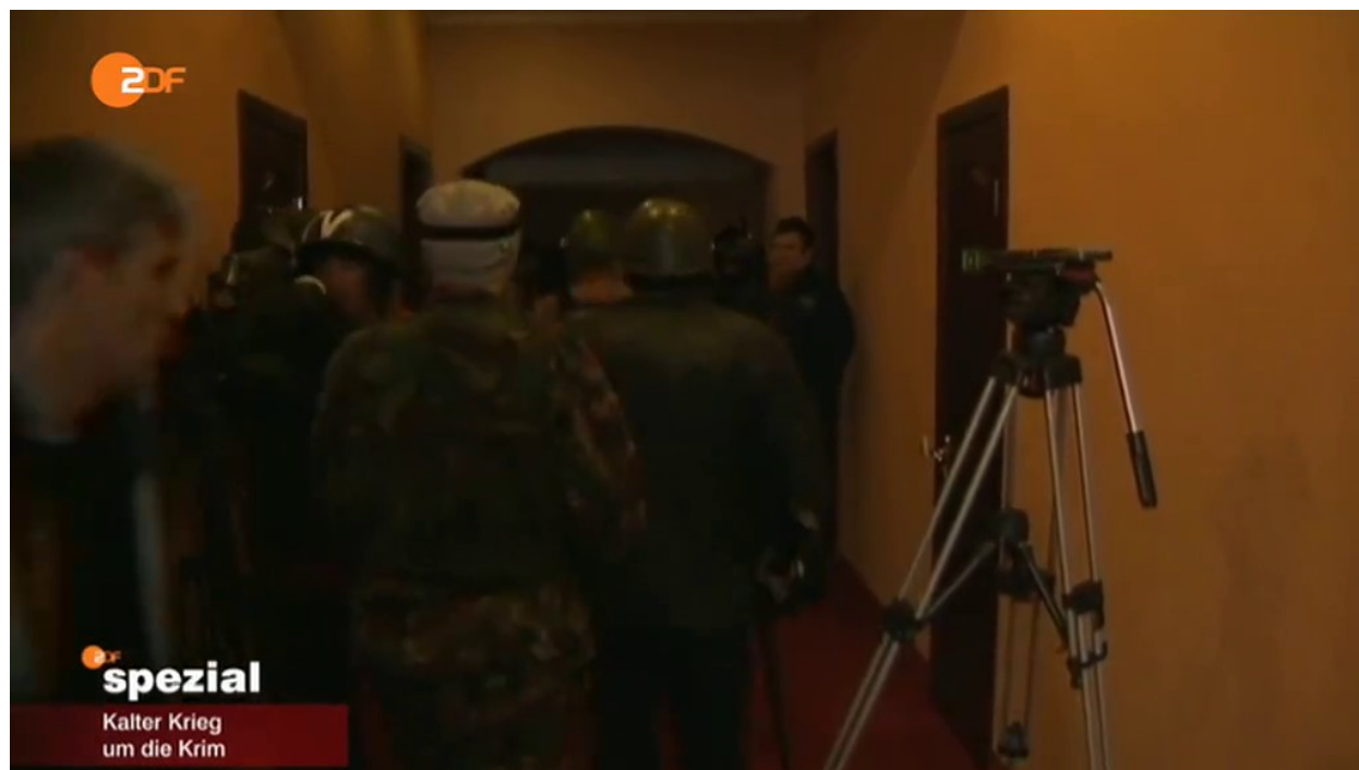
Photo 11. Ruslan Koshulynsky, deputy-speaker of the Ukrainian parliament from Svoboda, with Parasiuk-led group of shooters on the 14 floor of the Hotel Ukraina circa 10:22am during the massacre.

side. But the “roof snipers” were no longer acknowledged and their existence was denied within hours after the opposition members of the parliament went to the roof. An admission by a protester from the Parasiuk’s group that he went to the roof of the Hotel Ukraina but saw no snipers there is another evidence that the “shooters” on the roof were from the Maidan side. 261