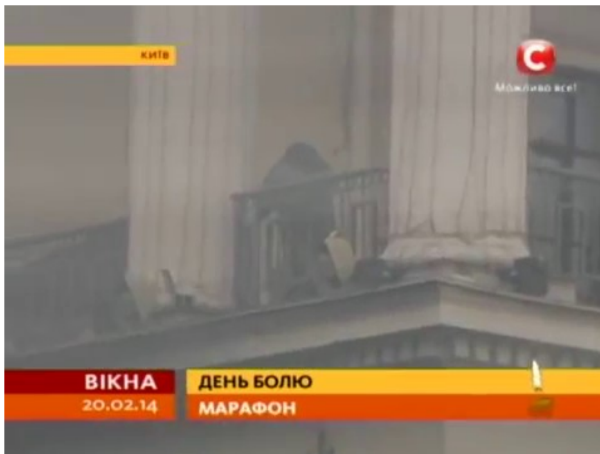
Photo 2. A reported shooter in the Music Conservatory around 8:00am during the mass shooting of the police by Maidan “snipers” from this building. (Source: “Хронологія бойового ранку: хто порушив перемир'я - Вікна-новини - 20.02.2014,” STB , February 20, 2014, https://www.youtube.com/watch?v=fdbae8rZ-qw ).

made from the Maidan stage at 8:45am about snipers on the roofs of buildings behind the stage, and protesters point to a sniper on the roof of Kozatsky Hotel. At the same time as the announcement about snipers was made, gunshots, including an apparent burst from a Kalashnikov assault rifle, were heard at 8:45-8:46 am. 50 Concurrently, as noted, this shooting was immediately followed by urgent requests of Internal Troops for five ambulances.