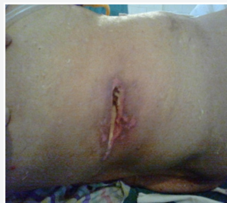
Figure 1: External Wound.