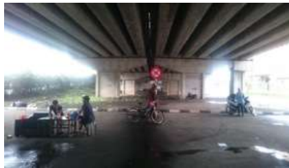
Fig. 6 and 7: Pedestrians and motorcyclist taking refuge from the rain underneath the highway.