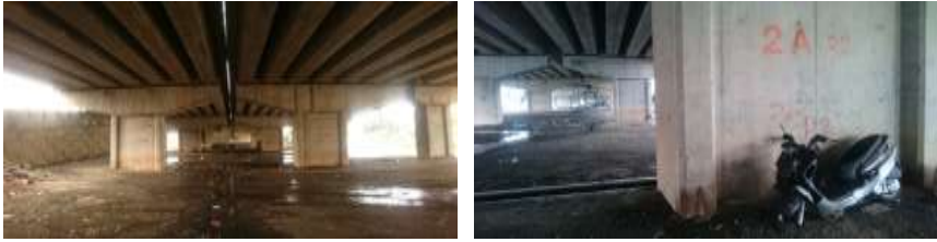
Fig. 9 and 10: Ambiguity and vagueness in specific function are represented in these two photographs.