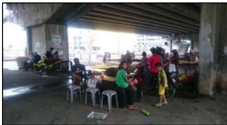
Fig. 4 and 5: Selling of food and beverages underneath DUKE near the Jalan Pahang – Sentul Pasar Interchange