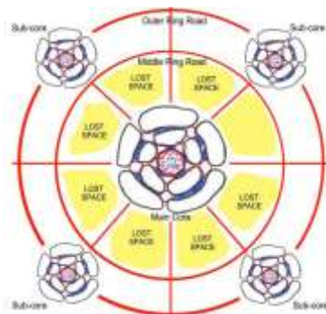
Fig. 1: The concept of satellite town in modern city planning, illustrating urban highways as important urban infrastructure that links sub-core and main core area

Merrilees et al. (2013) in their article, "City Branding: A Facilitating Framework for stressed Satellite Cities, discuss how workers and students travel to work in the major city and return to satellite city using congested highways. They define satellite cities as a phenomenon of population expansion, and changes in industrial bases, property development and demands for more affordable housing. Figure 1 illustrates the concept of satellite town in modern city planning. In contrast to the traditional urban fabric that promotes walking activities around cities, the zoning system in modern city planning has made urban dwellers highly dependent on urban highways. 109