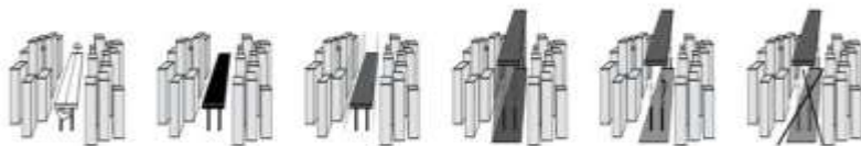
Fig. 2: The six impacts of elevated highways in urban areas as explored and illustrated by Saouma

Saouma (2008) conducted a thorough analysis of the impact of elevated highways in the urban area. Her findings revealed six (6) types of impacts: [1] Symbol of progression, increase accessibility and mobility; [2] Dominant structure in urban fabric; [3] Segregate community or neighbourhood, become physical and psychological barrier and visual intrusion; [4] Produce undefined space which often misused; [5] Allow minimum natural lighting and poor ventilation at space under the elevated structure and [6] Generate negative spaces or lost spaces which always been neglected. The six impacts are shown in Figure 2.